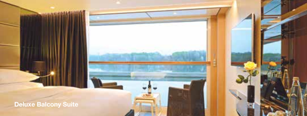
Deluxe Balcony Suite