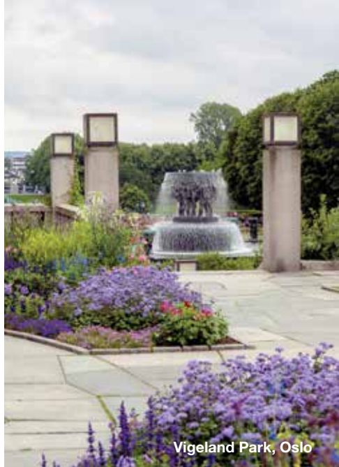
Vigeland Park, Oslo

Global Destinations Management Ltd. and Go Next Inc. are not responsible for injuries or losses resulting from any causes beyond their own respective and exclusive control or for the negligence of any other suppliers or providers. Land accommodations, local transportation, and sightseeing are arranged and operated by Go Next in England and Robinson Scandinavia in Norway, which may use other suppliers or providers to render the services.