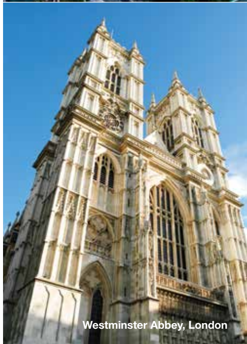
Westminster Abbey, London