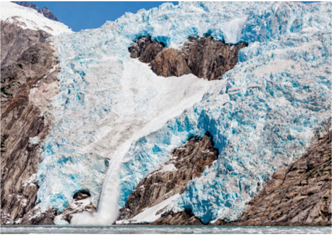
We see glaciers, wildlife, and marine life on a cruise to explore rugged Kenai Fjords National Park on Day 9.

We return to the lodge for lunch followed by an afternoon at leisure, perhaps to do some hiking or take an optional rafting excursion. This evening we convene for dinner and a lively show at the Denali Dinner Theater housed in an authentic log cabin. B,D