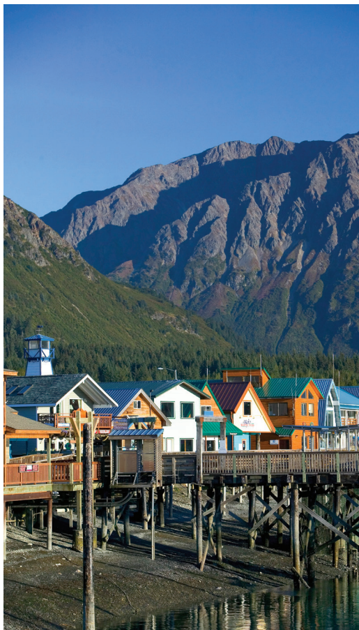
Colorful buildings overlook Seward’s harbor.