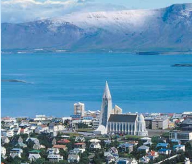
Tour Reykjavik and see the church of Hallgrímskirkja, which mirrors natural basalt formations along Iceland's southern coast.

Visit the sky-hued Blue Church and observe a specially arranged cultural and musical performance. Continue to the Technical Museum to learn more about the mechanical and architectural innovations that characterize this island nation, and enjoy light refreshments.