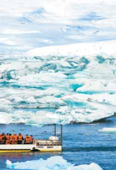
Glacier lagoon among 1000-year-old UNESCO-designated Vatnajökull National Park.