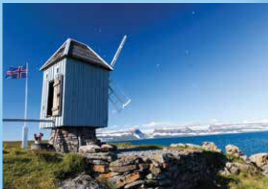
Explore Vigur Island, where Iceland's only windmill, built in 1840, sits on the serene seashore.

This afternoon, cruise up Ísafjarðardjúp, the dominant fjord of this remote 14-million-year-old region, framed by the dramatic rise of rugged mountains. Near the town of Ísafjörður, visit the open-air Ósvör Maritime Museum, where restored