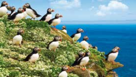
See puffins, nicknamed "little brothers of the north."