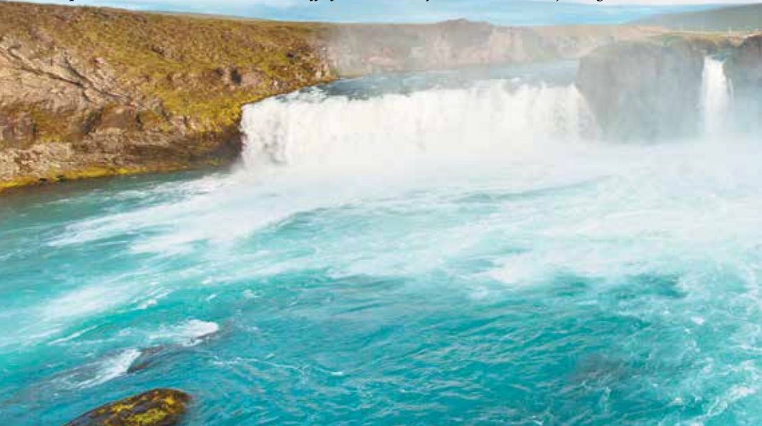
Photo this page: See gemlike Goðafoss, set among northern Iceland's craggy lava fields and rich green pastures. Cover photo: Touch the ice that has calved off of the luminously blue Breiðamerkurjökull glacier.