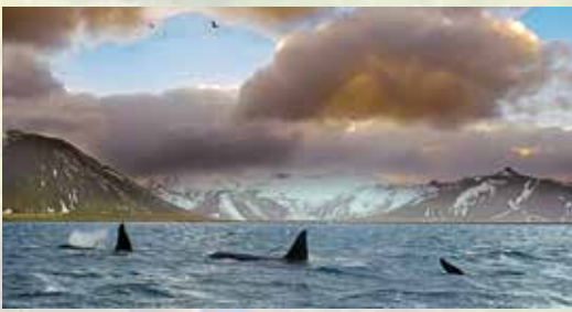
Look for gregarious orcas in Iceland's coastal waters.

Explore northern Iceland's extraordinary natural landscapes, stopping at Námaskarð—a geothermal wonder of boiling, sulfurous mudpots—and the pseudocraters at Skútustaðir, formed when hot lava flowed across the wetlands over 2000 years ago.