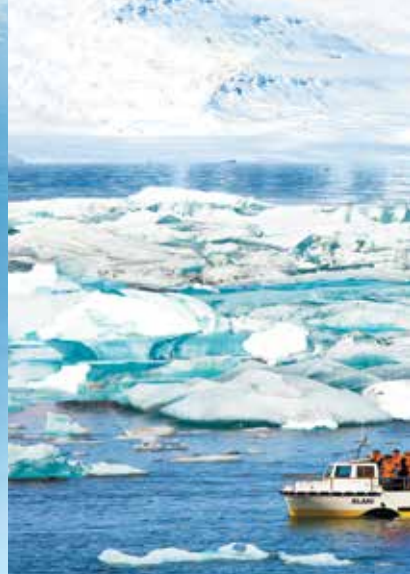
Cruise by small boat through Jökulsárlón glacial lagoon, surrounded by marbled and crystalline icebergs in UNESCO World Heritage Site.

Enjoy a music-filled performance illustrating sildarsöltun (traditional herring salting process). Return to the ship and cruise to Grímsey Island, which straddles the top of the world at 66 degrees north. Craggy coastal cliffs and basalt formations host dozens of species of seabirds, including puffins and auks. Walk across the Arctic Circle, where the island is lush with grasses and mosses.