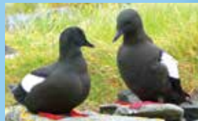
Spot black guillemots resting on the shore and cliff faces.

Clinging to the foot of steep mountain walls at the entrance to a gorgeous fjord, charming Siglufjörður is one of Iceland's most dramatically sited towns. Multicolored houses lead to a bustling harbor, the hub of the town's fishing industry. Siglufjörður celebrates the glory days of herring fishing at the award-winning Herring Era Museum, which recreates the history of fish salting and oil processing during the early 20 th century.