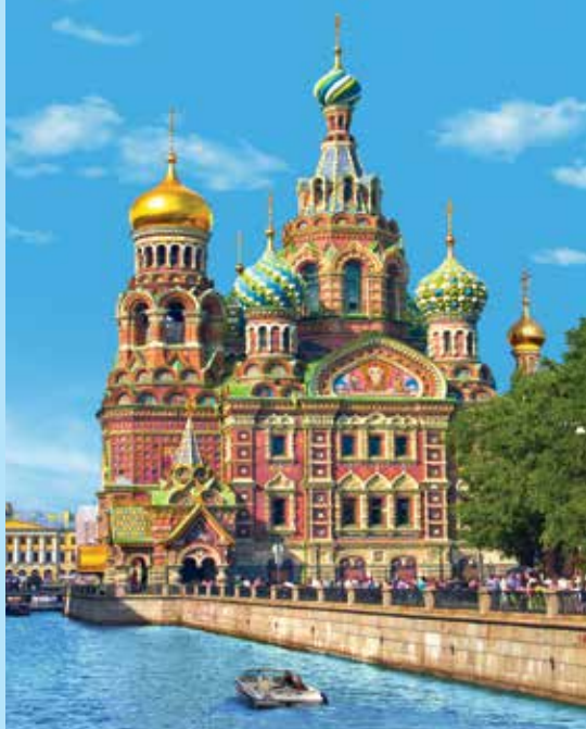
St. Petersburg's Church of the Resurrection of Christ is a showcase of neo-medieval Russian architecture.