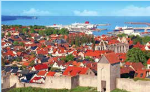
Visby's medieval wall, constructed in the 13 th century, stretches two miles in length around the town.

See exquisite examples of Russian Baroque and neoclassical architecture along the main thoroughfare, Nevsky Prospekt, and view the iconic Church of the Savior on Spilled Blood (Church of the Resurrection of Christ), built on Emperor Alexander II's assassination site.