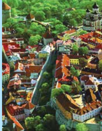
Tallinn, a hub of culture and commerce, is a city with a rich history in the 600-year-old spires and