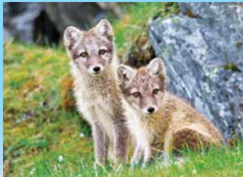
Native to the Arctic tundra biome, Arctic foxes use their acute hearing to locate prey precisely.