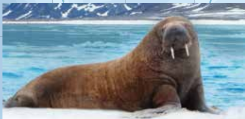
Watch for "Arctic Giants," enormous walrus weighing up to 1.5 tons.

In the bell-shaped sound of Bellsund, surrounded by soaring, snow-covered peaks, anchor off Calypsobyen, part of