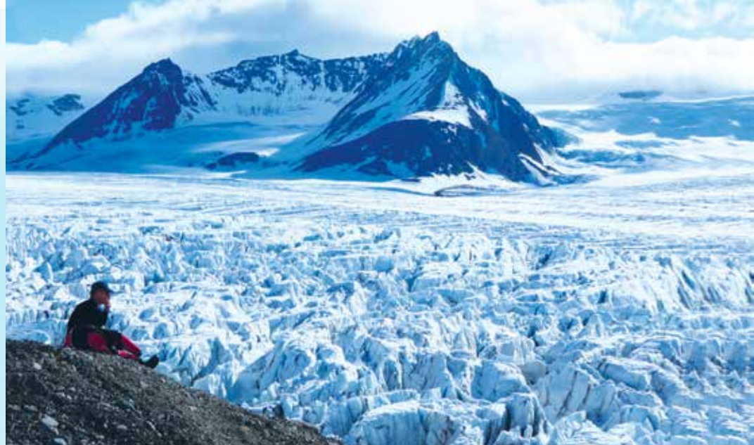
Be among the few to view expansive, breathtaking Arctic ice, the oldest of which appears the darkest blue.

predator's hunting as they search for seals within a melting and refreezing matrix of ice patches.