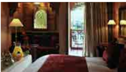
Sofitel Marrakech Palais Imperial Hotel