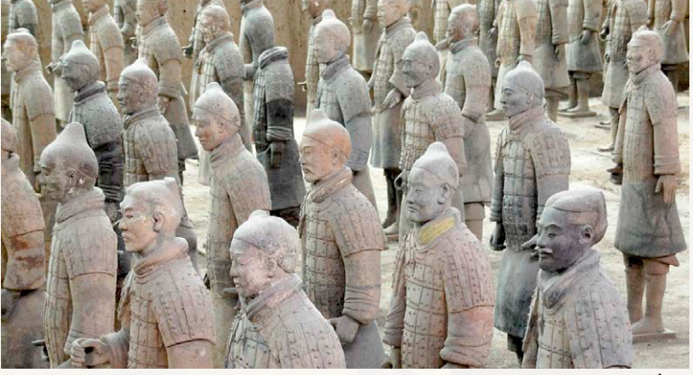
Terracotta Warriors, Xi'an