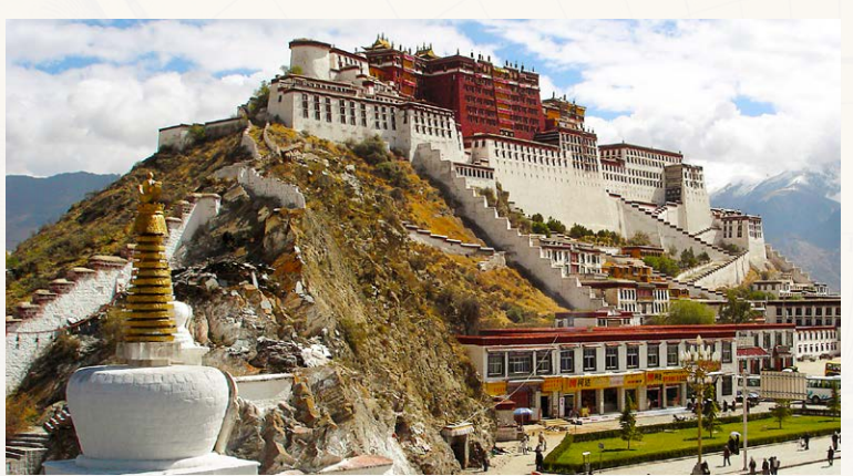
Potala Palace, Tibet

Experience the best of mysterious China and enchanting Tibet-two lands whose stunning beauty forms the backdrop of centuries-old civilizations steeped in legend and tradition. This exceptional, custom-designed and comprehensive 16-day journey encompasses the breadth of China from the Himalayan "Rooftop of the World," with three nights in seldom-visited "Sun City" of Lhasa, through the dramatic gorges of the Yangtze River and to the historic neighborhoods of Old Shanghai. Enjoy Five-Star accommodations in centrally located hotels in Beijing, Xi'an and Lhasa and in Shanghai's historic FAIRMONT PEACE HOTEL. Aboard the deluxe VICTORIA JENNA, cruise for three nights from Chongqing to Maoping. Tour the impressive Three Gorges Dam. Visit eight UNESCO World Heritage sites. Walk along the Great Wall and through Beijing's Forbidden City and Tiananmen Square. Visit the ancient capital of Xi'an and view the Terra Cotta Warriors. Explore Tibetan temples and monasteries, including Potala Palace, the former winter residence of the Dalai Lamas, and experience Shanghai's Bund and Pudong districts, including the Shanghai Museum. Hong Kong Post-Program Option.