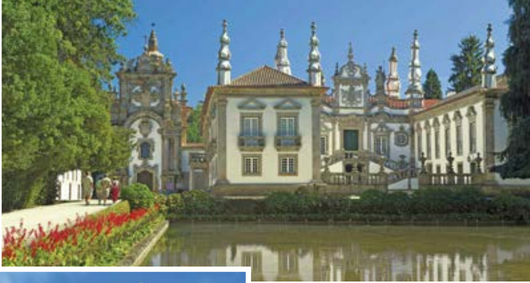
Above: Manor Solar de Mateus, Vila Real Left: Tower of Belém, Lisbon