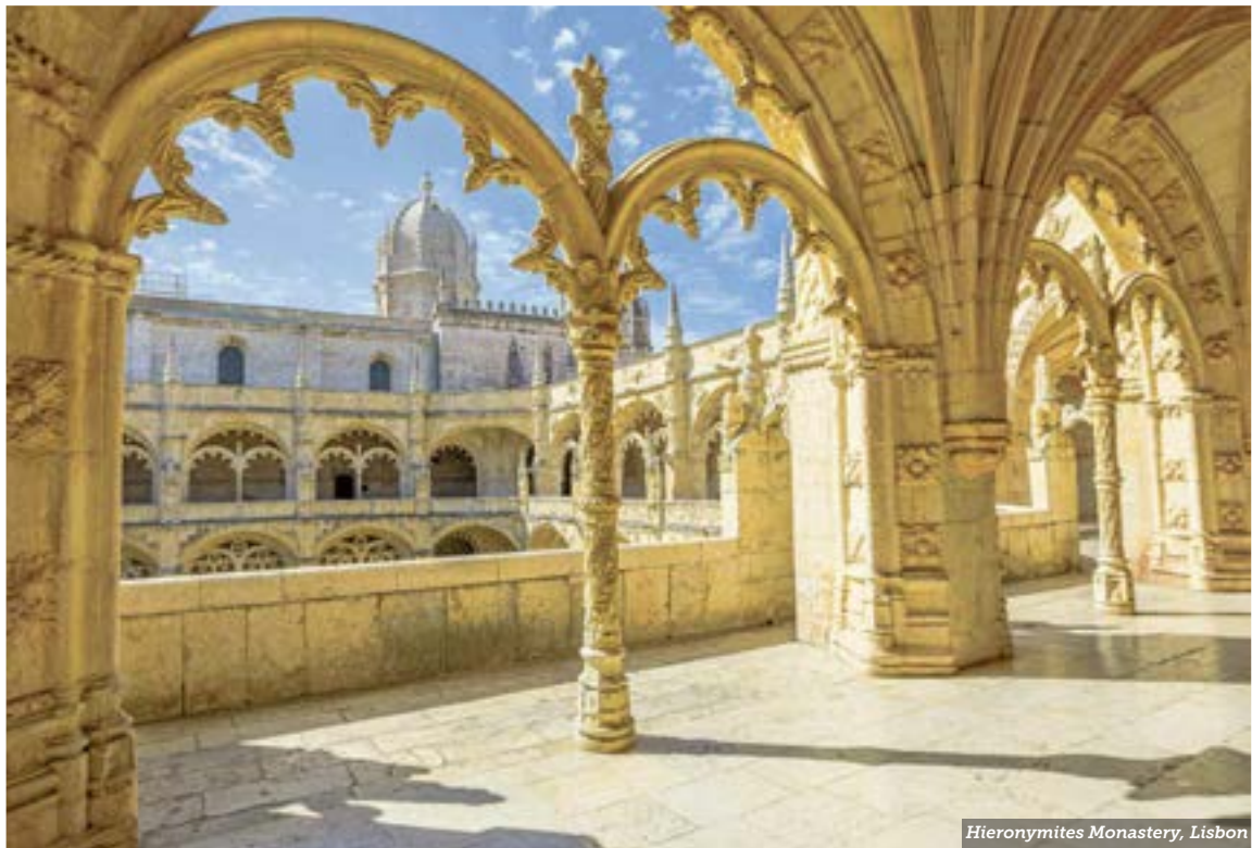
Hieronymites Monastery, Lisbon