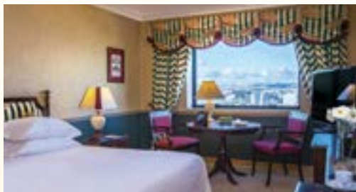
DOM PEDRO PALACE LISBON | LISBON