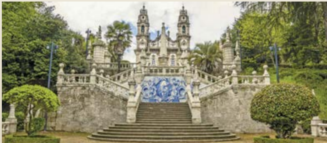
Above: University of Coimbra Below: Nossa Senhora dos Remedios, Lamego

Explore vibrant Porto. Visit the Palacio da Bolsa, the historic Stock Exchange and the Igreja da São Francisco, the Church of St. Francis. Conclude your outing with a wine tasting.