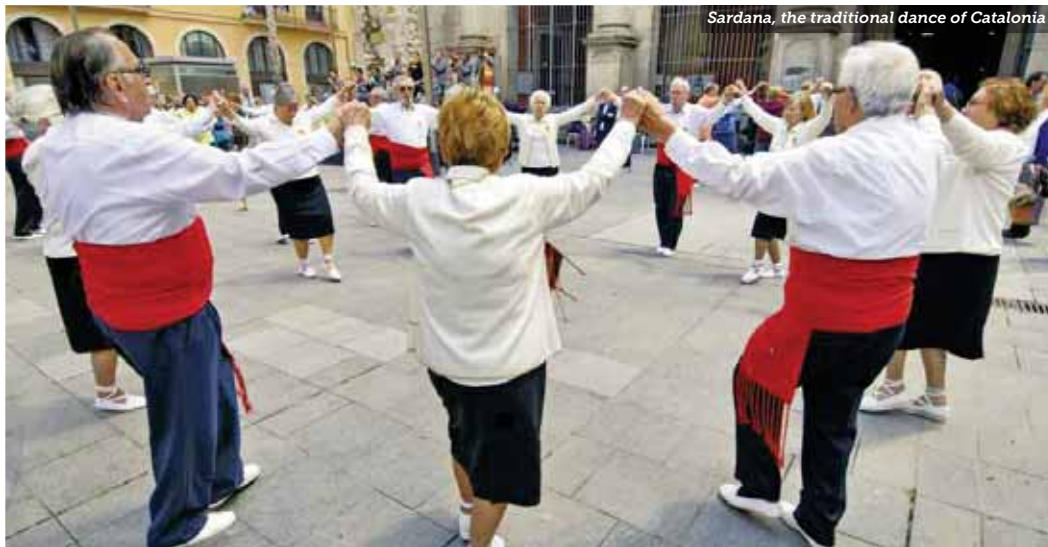
Sardana, the traditional dance of Catalonia