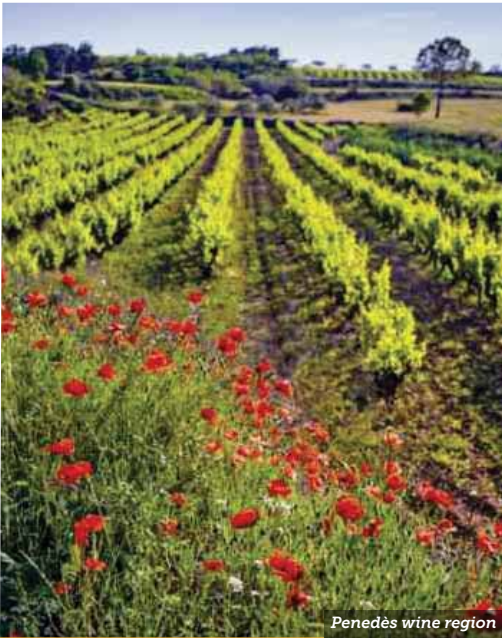
Penedès wine region