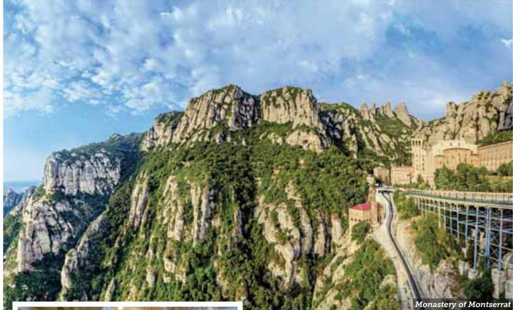
Monastery of Montserrat