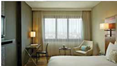
Above: Terrace | Deluxe room