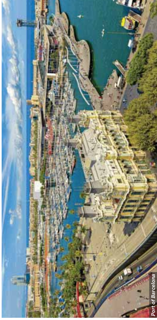
Port of Barcelona