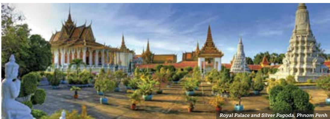
Royal Palace and Silver Pagoda, Phnom Penh