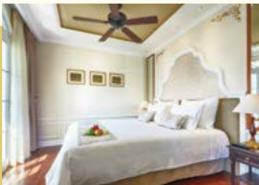
Mekong Navigator cabin

Later, disembark the ship and return to Hanoi.