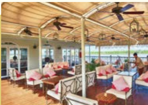
Mekong Navigator lounge

B|L|D denotes included breakfasts, lunches and dinners.