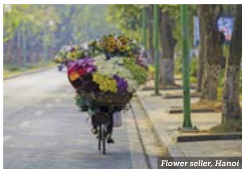
Flower seller, Hanoi

Sea, and Cha Tam Church, the site where President Ngo Dinh Diem was arrested in 1963.