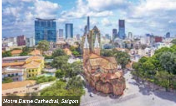
Notre Dame Cathedral, Saigon

with French colonial architecture, and see the Lake of the Restored Sword, a tranquil setting. Check in to the Sofitel Legend Metropole Hanoi Hotel.