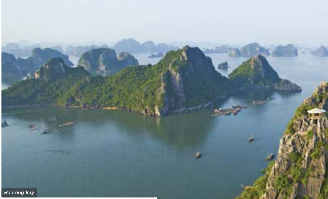
Ha Long Bay