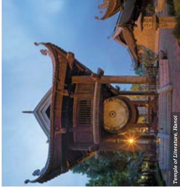
Temple of Literature, Hanoi