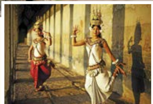
Above: Angkor Thom | Inset: Apsara dancers

Uncover the legendary ruins of Ta Prohm and witness Thommanon, a recently restored temple with exquisite, intricate Apsara carvings.