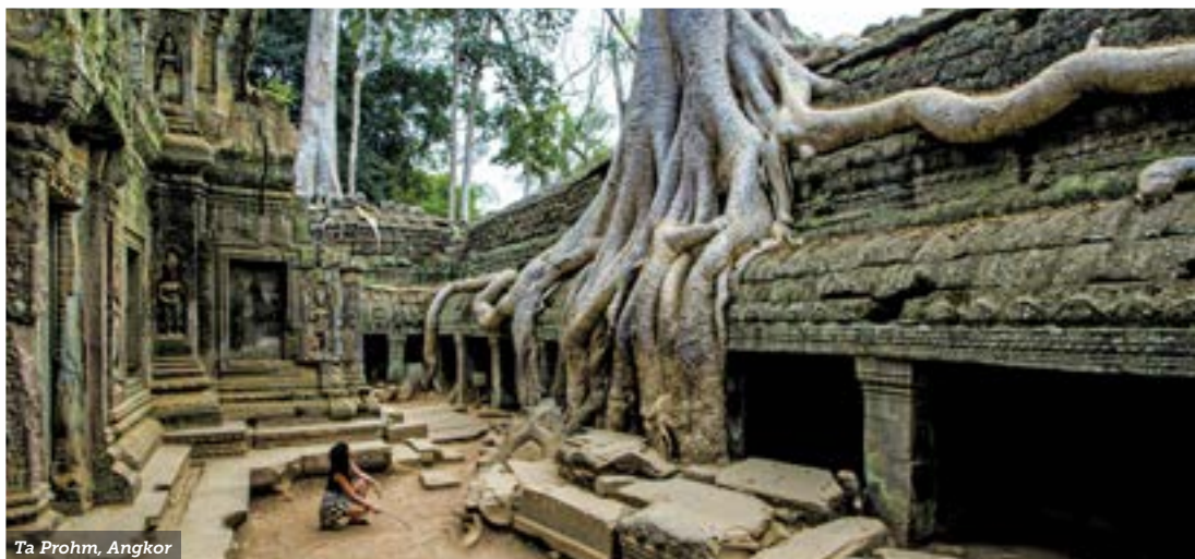
Ta Prohm, Angkor