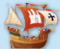
Hanseatic Cog Ship