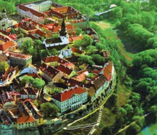
...merce since the Hanseatic League, reflects its history in that define its picturesque skyline.

Explore the impressive ruins of the 13 th -century Hammershus Slot, the largest medieval castle in Scandinavia, and visit one of the island's iconic, round, whitewashed rundkirke (round churches), an outstanding contribution to Nordic medieval architecture, which also once served as fortresses. Enjoy a tasting of traditional smoked herring in Gudhjem ("God's Home"), a picturesque harbor town of colorful, red-roofed, half-timbered houses and sloping cobblestone streets. Enjoy time at leisure before returning to the ship.