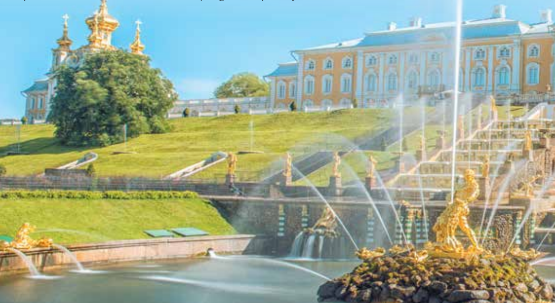
Photo this page: Peter the Great himself partially engineered the resplendent plexus of waterfalls, fountains and statues that adorns the foreground of the opulent Grand Palace at Petrodvorets.

Cover photo: Spanning 14 small islands, where shimmering Lake Mälaren meets one of the largest archipelagos in the Baltic Sea, Stockholm balances medieval and Renaissance architecture with modern urban design.