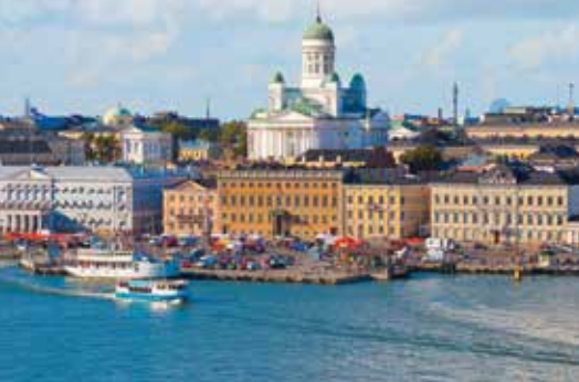
Finland's waterfront capital city of Helsinki showcases elegant Jugendstil architecture along its picturesque harbor.