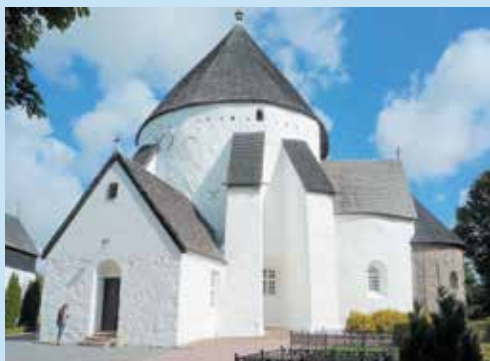
Oesterlars Church is the largest "round church" on Bornholm Island, Denmark.

where legendary landmarks are scattered across more than 100 islands linked by more than three times as many bridges. St. Petersburg's main thoroughfare, Nevsky Prospekt, showcases exquisite examples of Russian Baroque and neoclassical architecture. See the ornate Church of Our Savior on Spilled Blood (Church of the Resurrection of Christ), built on the site of Emperor Alexander II's assassination, and the 19 th -century St. Isaac's Cathedral, with a striking golden dome that is one of the glories of the city's skyline. Visit St. Petersburg's first building, the Peter and Paul Fortress, constructed to secure the country's access to the sea, and the impressive Baroque Cathedral of