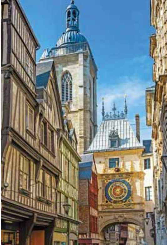
Left: Gros Horloge, Rouen | Below: Les Braves, Omaha Beach