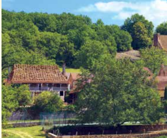
Laauze-roofed, medieval maisons cluster around Saint-Amand-de-Colly, one of the most striking of Périgord's fortified churches.