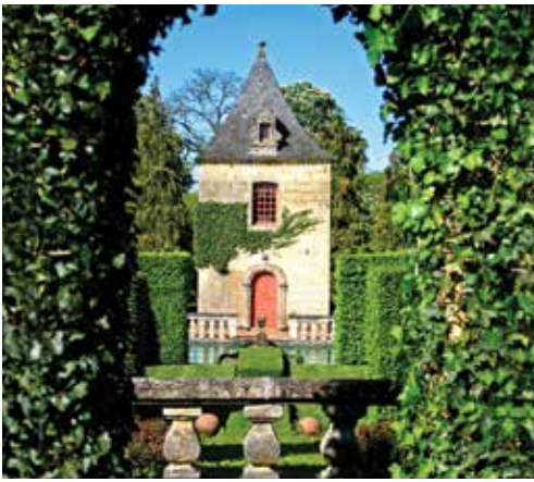
Admire the finest "English" gardens in France as you stroll through the enchanting grounds of Eyrignac Manor.

PRSR STD U.S. Postage PAID Gohagan & Company