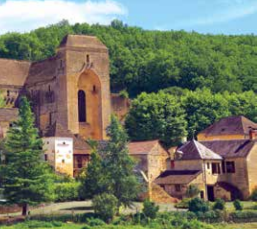
Petit-Saint-Amand-de-Coly's yellow limestone Augustinian abbey,

from across Europe to perform penance by ascending the 216 steps of le Grand Escalier (the Grand Stairway) on their knees to pay homage to the Virgin Mary and to seek miracles from St. Amadour by visiting his crypt. Embedded in the cliff above the doorway to the Chapelle de Notre Dame is a sword said to be that of the heroic knight Roland.