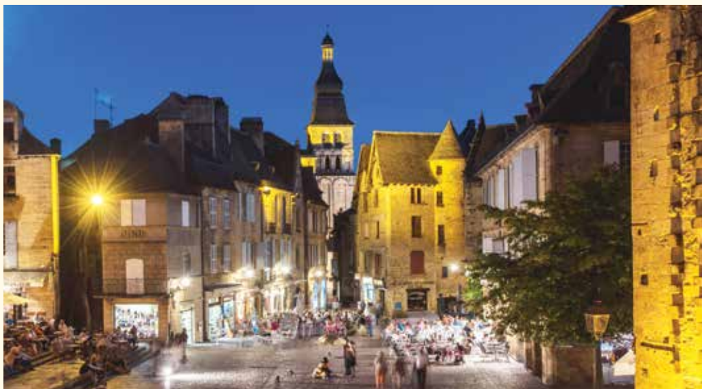
Relish regional specialties prepared from the freshest ingredients in the village of Sarlat’s delightful market, one of the best in France.

Built on the face of a sheer 400-foot cliff, the UNESCO World Heritage-designated village of Rocamadour has one of the most dramatic settings of any village in the world. During the Middle Ages, pilgrims flocked here