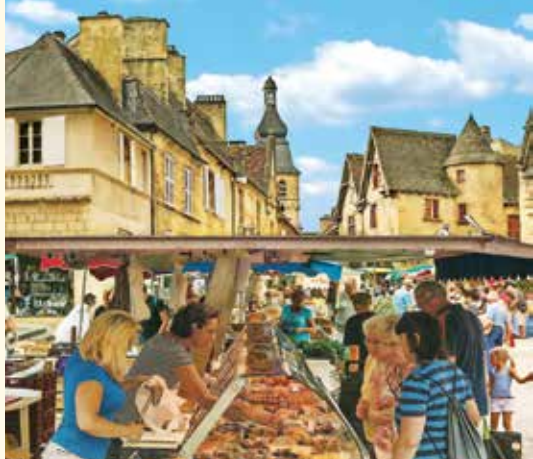
Experience Sarlat-la-Canéda's twice-weekly market, a medieval tradition in the heart of the village.

See L'Abri du Cap-Blanc's UNESCO World Heritage-designated prehistoric cave friezes.