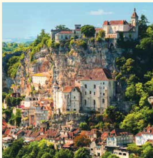
Rocamadour has beckoned travelers and pilgrims alike to its summit above a tributary of the Dordogne River.

Visit Rouffignac, "Cave of a Hundred Mammoths," and marvel at the "giant kettles," smooth, dome-like rock formations forged by swirling currents.