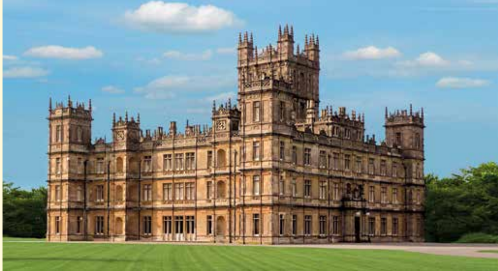
Highclere Castle, a spectacular Victorian family home, was the filming site for PBS MASTERPIECE's popular Downton Abbey television series.