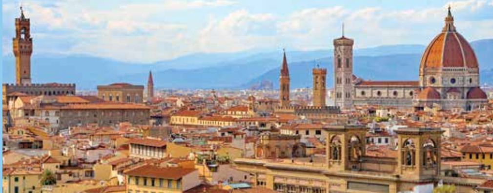
The tower of the Palazzo Vecchio and Filippo Brunelleschi's magnificent dome are exemplary symbols of Florence.

Enjoy a walking tour of the Old Town, panoramic views from the hill of Cimiez and a visit to the Musée National Marc Chagall.