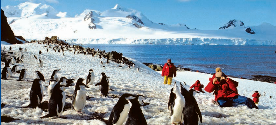
Enjoy an up-close, unparalleled view of chinstrap penguins in their natural Antarctic habitat.

marine wildlife including humpback whales, crabeater seals and Cape petrels.