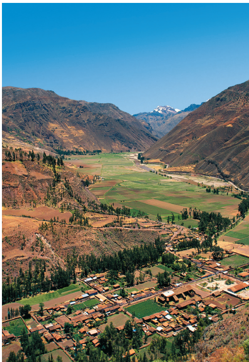
The beautiful and historic Sacred Valley