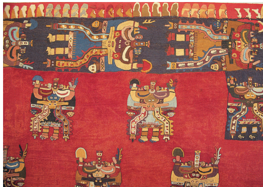
Traditional Peruvian fabric

Day 11: Arrive U.S. We arrive in the U.S. this morning and connect with our flight home.