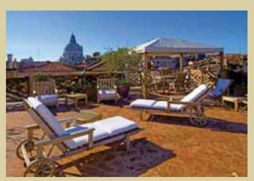
HOTEL SATURNIA & INTERNATIONAL | VENICE