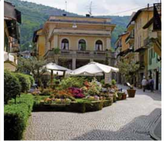
Top: Duomo, Milan | Above: Stresa

Islands. Board a private motorboat and cruise turquoise Lake Maggiore to Isola Madre, the largest of the Borromean Islands. A guided visit of Isola Madre's extensive botanical gardens reveals exotic flowers, rare plants and ancient trees, and you may also spy peacocks and parrots. Nearby, experience the rustic charm of Isola dei Pescatori where narrow streets are lined with local artisans and the quaint houses of local fishermen. Finally, visit Isola Bella, the Beautiful Island, extolled by writers over the centuries. Explore its 17thcentury baroque palace and summerhouse, home to a mosaic grotto and a unique collection of art and antiques. A relaxing stroll through the property's hanging gardens, rich with botanical treasures, offers a pleasant conclusion to your Borromean adventure!