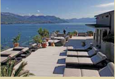
HOTEL LA PALMA | STRESA