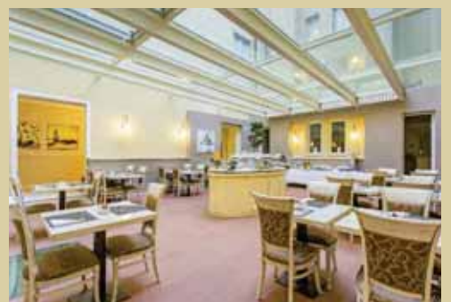
PALAZZO SAN LORENZO | COLLE DI VAL D'ELSA