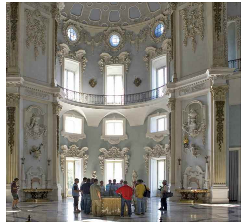
The Borromeo's Palace, Isola Bella

The information in this flier is correct at the time of printing. Please visit our website to ensure that you receive the most current information.