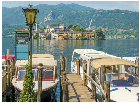
San Giulio, Lake Orta

Contemporary Italy. Learn about Italy's current economy, politics, society and role in the European Union.