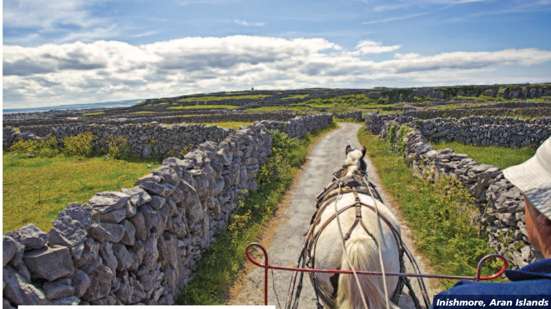
Inishmore, Aran Islands