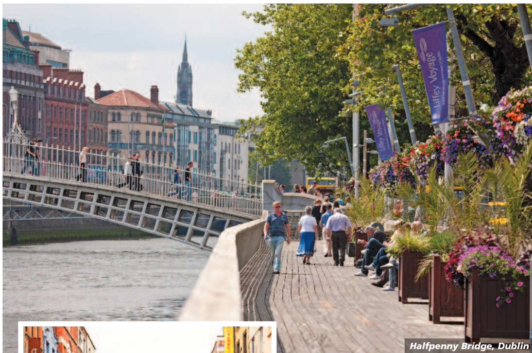
Halfpenny Bridge, Dublin