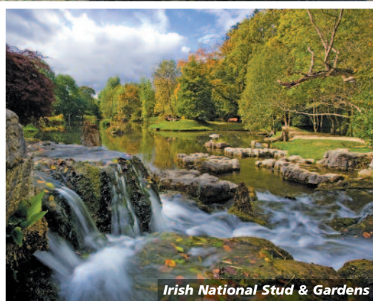
Irish National Stud & Gardens