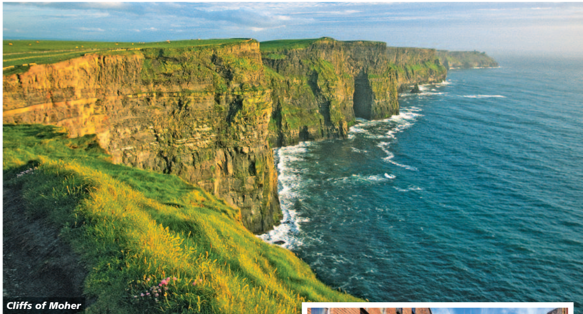
Cliffs of Moher