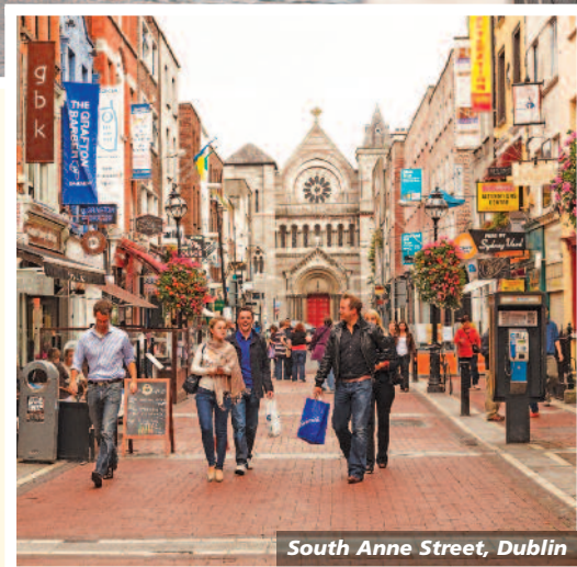
South Anne Street, Dublin