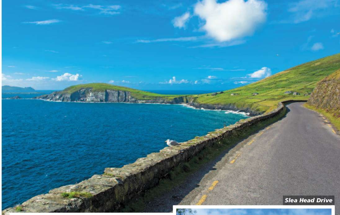
Slea Head Drive