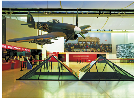
Caen Memorial Museum

D-Day and the Battle of Normandy. Discuss the role that Normandy and its citizens played during this crucial period of the Allied war effort.