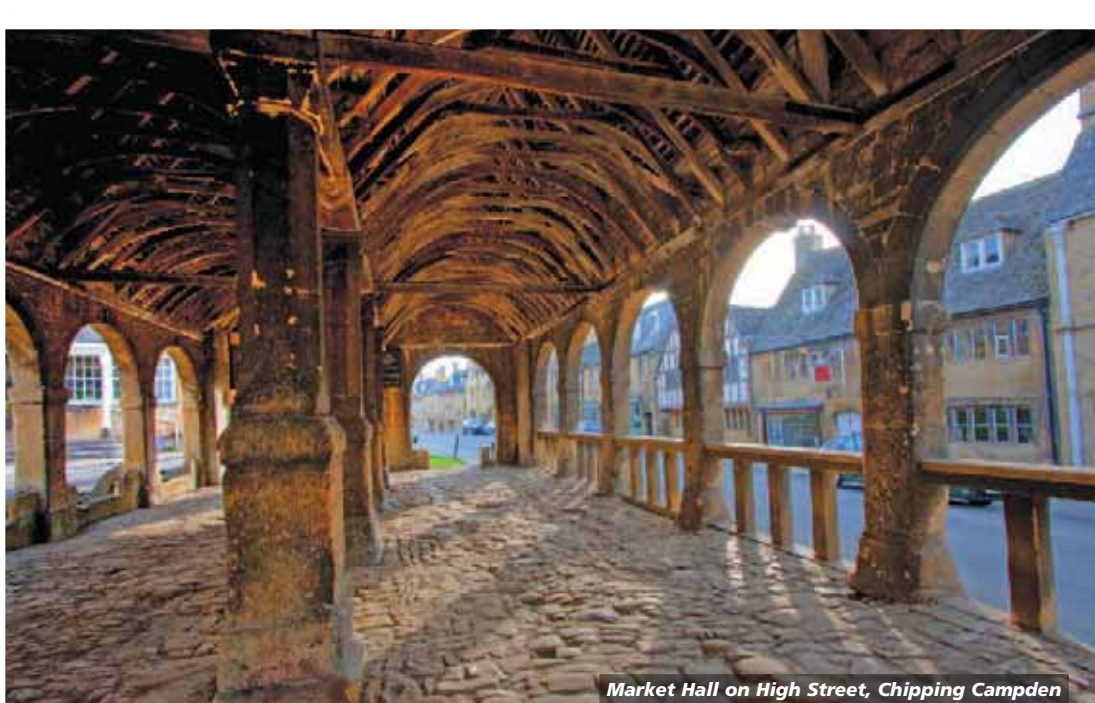
Market Hall on High Street, Chipping Campden