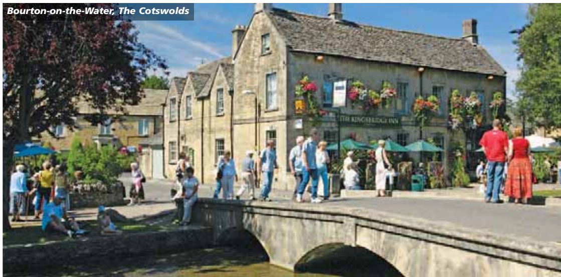
Bourton-on-the-Water, The Cotswolds