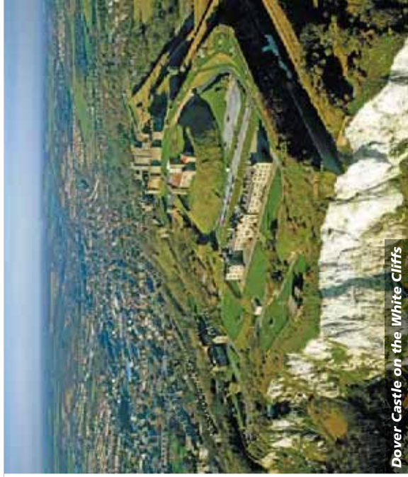
Dover Castle on the White Cliffs