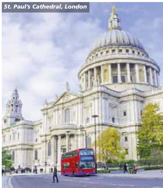
St. Paul's Cathedral, London

Discovery: Chartwell. Step into history today during a visit to Chartwell, home of Sir Winston Churchill and his wife. The Victorian country home, originally dating from the Tudor era, is a picture of life from when Churchill, his wife, Clementine, and their children lived there, with many of their belongings, photographs and books still in the home. Stroll through his art studio, and take advantage of leisure time to appreciate the gardens and Clementine's Golden Rose walk.