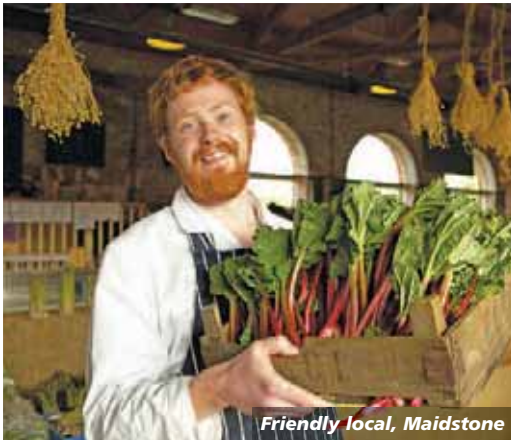
Friendly local, Maidstone

Enrichment: Canterbury Tales . Learn about these time-honored stories that reflect the