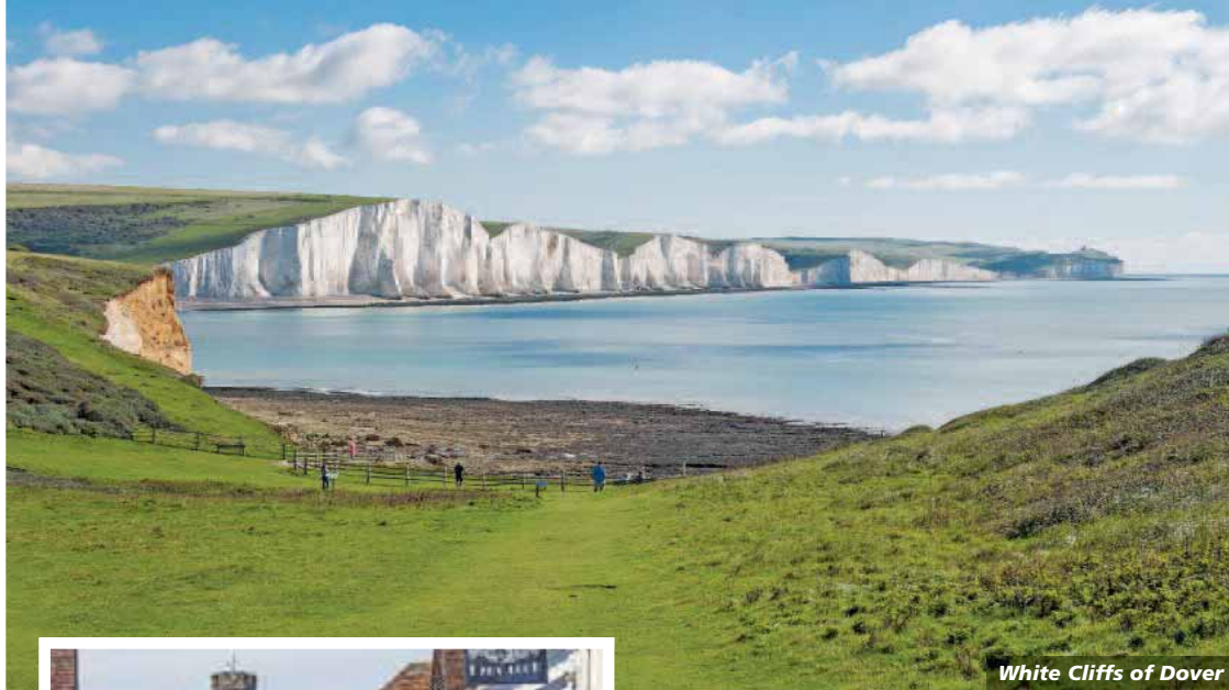
White Cliffs of Dover