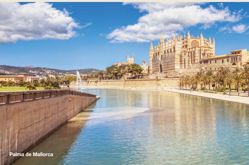
Palma de Mallorca