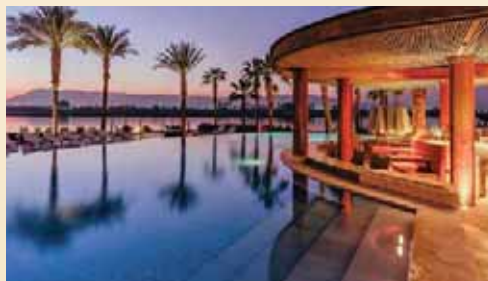
Hilton Luxor Resort & Spa | Luxor