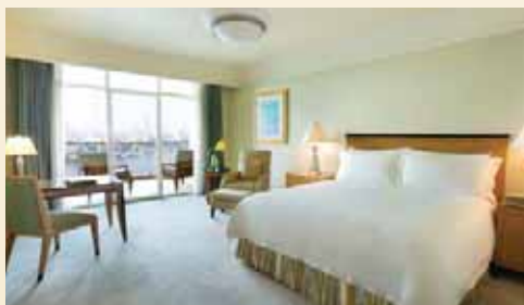
Four Seasons Hotel Cairo at Nile Plaza | Cairo