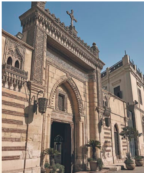
Hanging Church, Cairo

After breakfast, check out of the hotel.