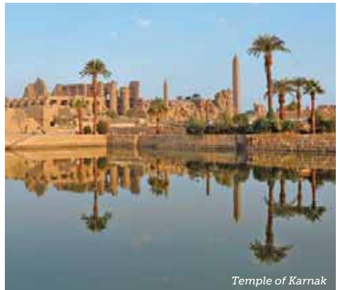
Temple of Karnak