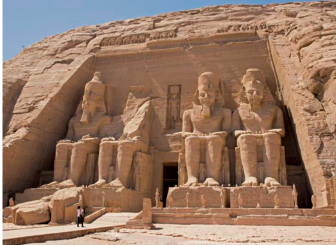
Temple of Ramses II, Abu Simbel