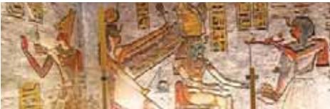
Hieroglyphics, Valley of the Kings