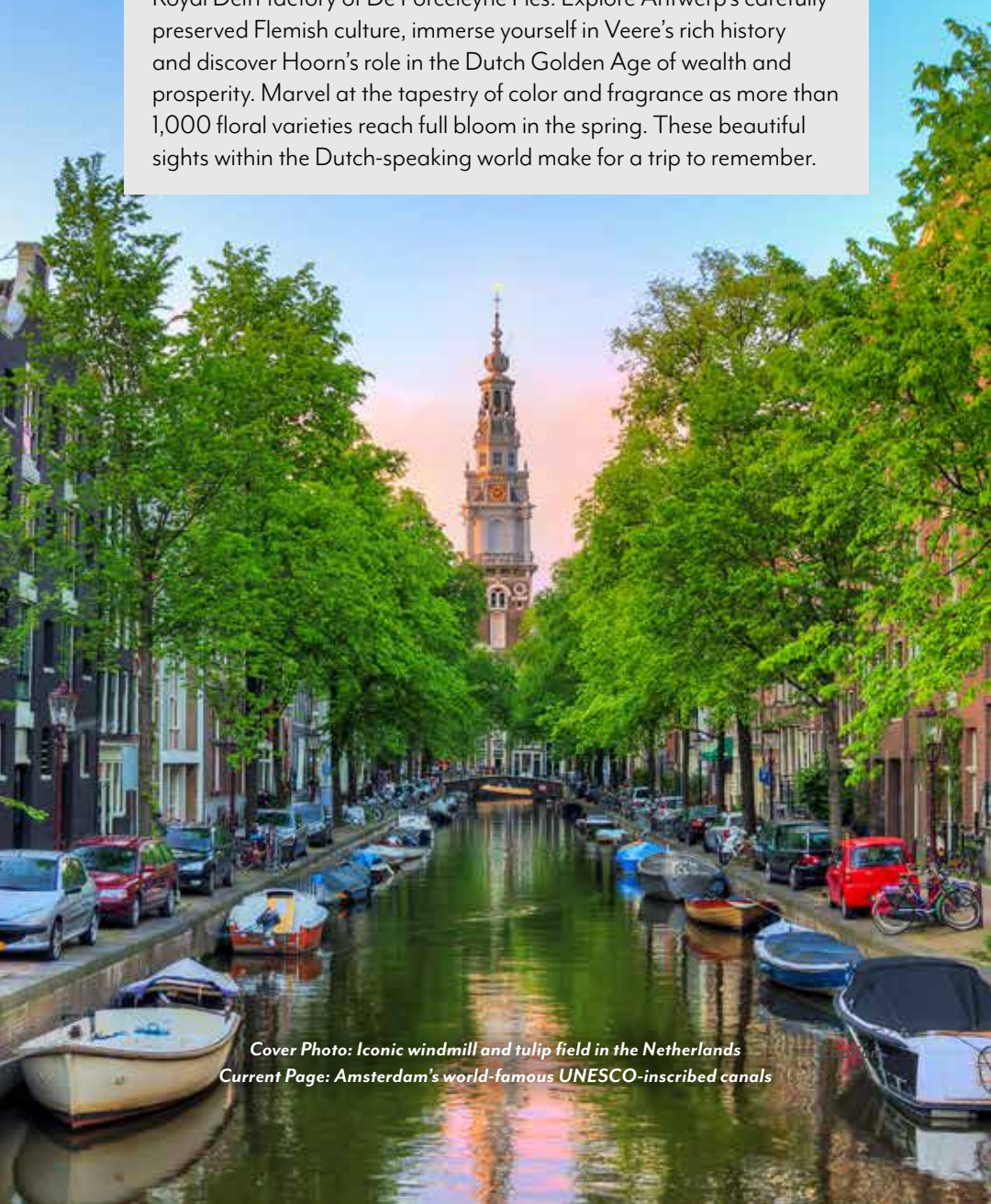
Cover Photo: Iconic windmill and tulip field in the Netherlands Current Page: Amsterdam’s world-famous UNESCO-inscribed canals

Behold the many beautiful sights — and the striking works of art they inspired — along the waterways of Holland and Flanders. This nine-day, eight-night trip aboard the deluxe river boat Viva Enjoy includes visits to four UNESCO World Heritage sites — among them the network of authentic windmills in Kinderdijk and Amsterdam’s canal district. Admire the second-largest collection of Vincent van Gogh’s art in the world. Watch hardworking craftspeople create the world-renowned “Delft Blue” porcelain at the original Royal Delft factory of De Porceleynne Fles. Explore Antwerp’s carefully preserved Flemish culture, immerse yourself in Veere’s rich history and discover Hoorn’s role in the Dutch Golden Age of wealth and prosperity. Marvel at the tapestry of color and fragrance as more than 1,000 floral varieties reach full bloom in the spring. These beautiful sights within the Dutch-speaking world make for a trip to remember.