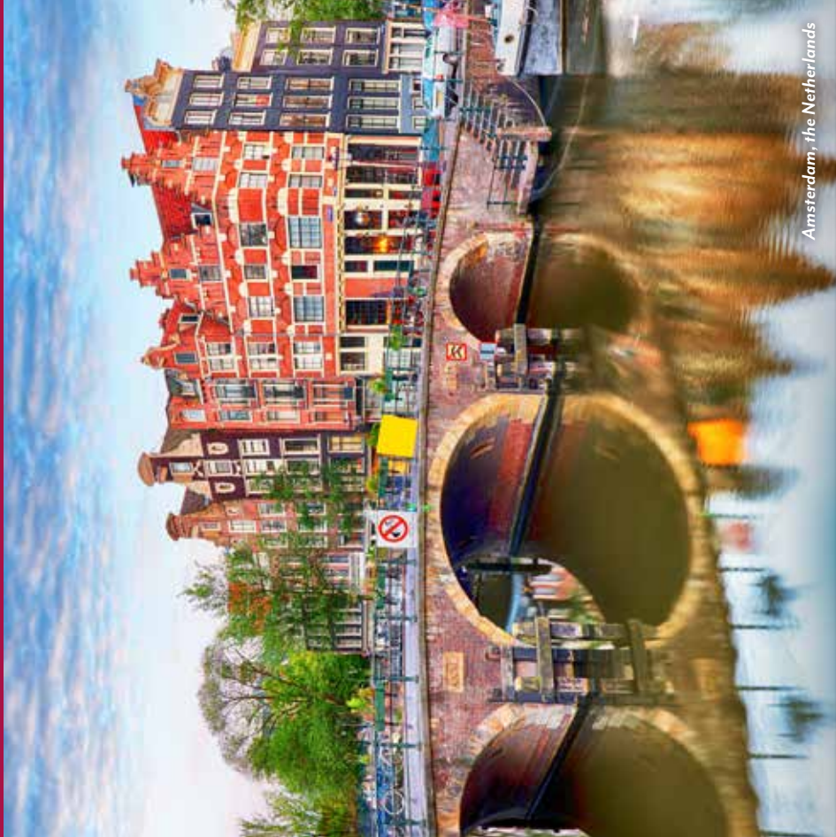
Amsterdam, the Netherlands

PRSR1 STD U.S. Postage PAID Gohagan & Company