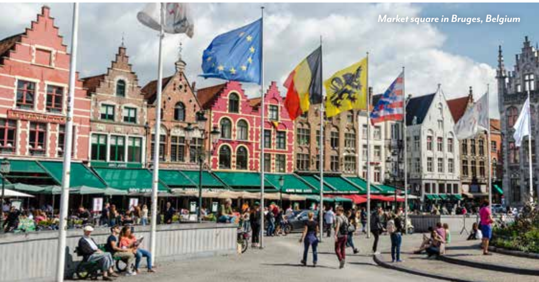
Market square in Bruges, Belgium

A scenic drive through Flemish countryside takes you to Bruges, where you'll enjoy a walking tour to the Gothic Town Hall, the famous and UNESCO-inscribed octagonal