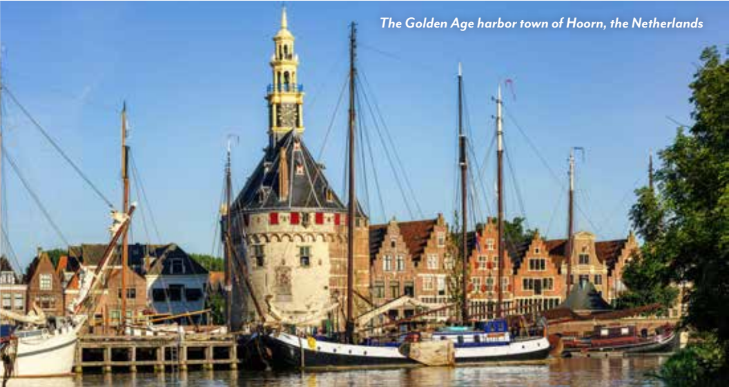
The Golden Age harbor town of Hoorn, the Netherlands

After breakfast, transfer to the airport for your flight home. (B)