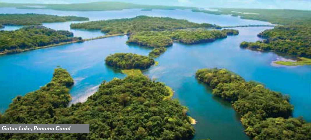
Gatun Lake, Panama Canal