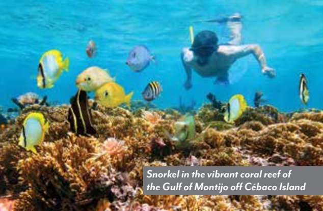
Snorkel in the vibrant coral reef of the Gulf of Montijo off Cébaco Island