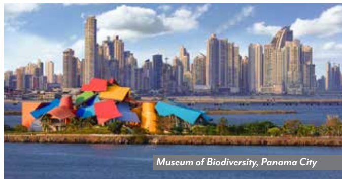
Museum of Biodiversity, Panama City

In the sparkling Gulf of Montijo, snorkel in the emerald waters of seldom-visited Cébaco Island, where schools of brilliantly colored fish, giant manta rays and four different species of turtles swim amid spectacular rock reefs.