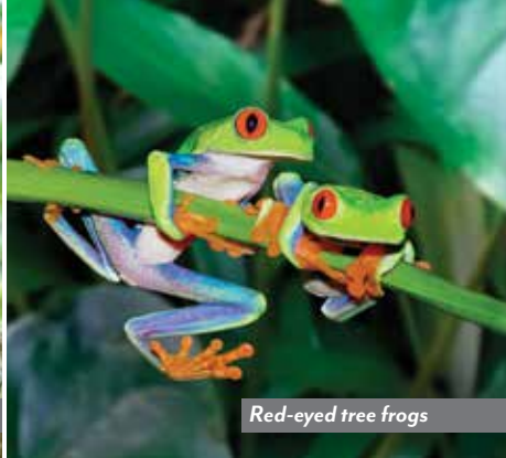
Red-eyed tree frogs