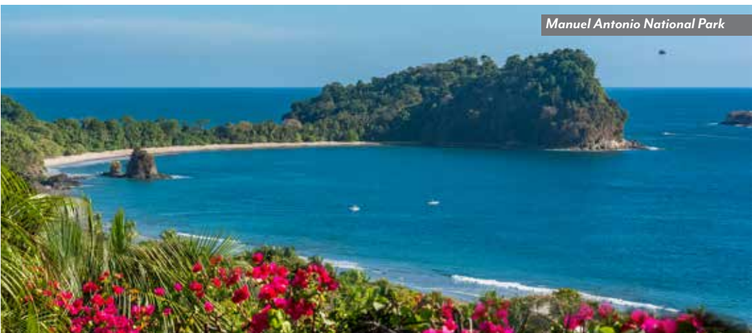
Manuel Antonio National Park

Transfer to Panama City for your return flight home.