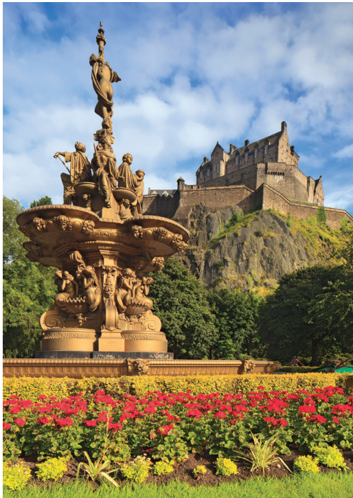
Scotland’s Edinburgh Castle

Day 13: London A panoramic city tour this morning passes such celebrated London landmarks as the infamous Tower of London, grand Parliament and Big Ben, Buckingham Palace, Westminster Abbey,