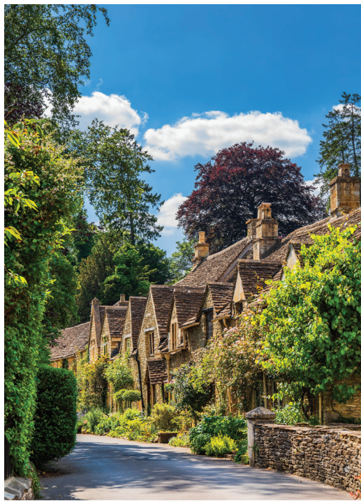
Rural Cotswolds village

and Hyde Park. Our afternoon is at leisure to explore this wondrous city as we wish; London offers an embarrassment of riches from which to choose. Tonight we celebrate our journey through Britain at a farewell dinner. B,D