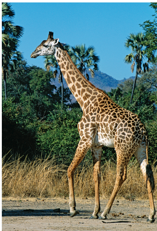
South Luangwa giraffe

Day 12: South Luangwa National Park We have another day to savor life in the bush and engage in morning and evening game viewing activities. Set amidst a grove of ebony and mahogany trees, our 18-chalet lodge overlooks two lagoons that attract a steady stream of crocodiles, hippos, giraffe, buffalo,