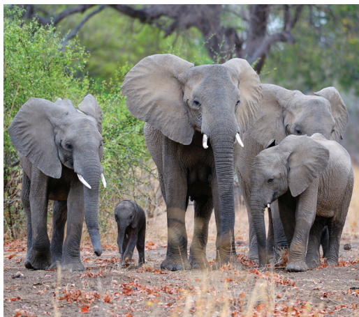
Elephants abound at Chobe

antelope, and other animals, which we can watch from lodge’s open deck. Tonight, we celebrate our wildlife adventure at a farewell dinner. B,L,D