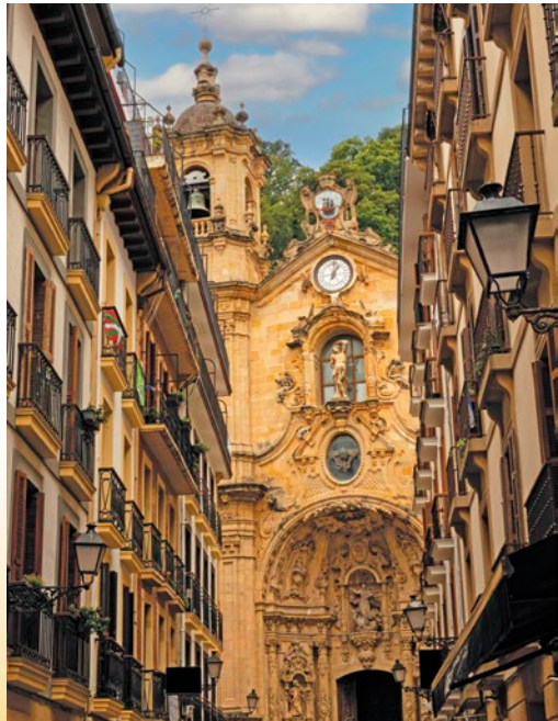
Basilica de Santa María del Coro, San Sebastián