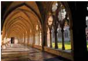
Above: Cloister of Sainte-Marie Cathedral, Bayonne Right: Sainte-Marie Cathedral