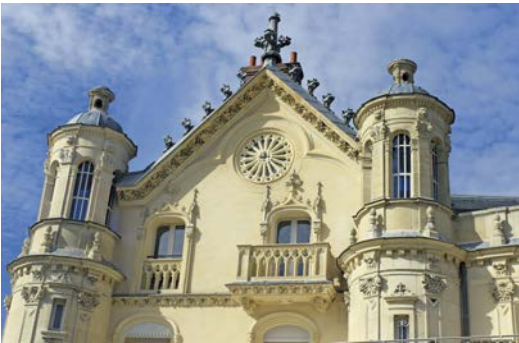
Architectural detail, Conflans-Sainte-Honorine

Discovery: Versailles. Journey to Versailles, France's grandest palace. Versailles was France's political capital and seat of the royal court from 1682-1789. See the opulent rooms, sprawling gardens and the famous Hall of Mirrors. The Treaty of Versailles, which ended World War I, was signed in the famous Hall of Mirrors.