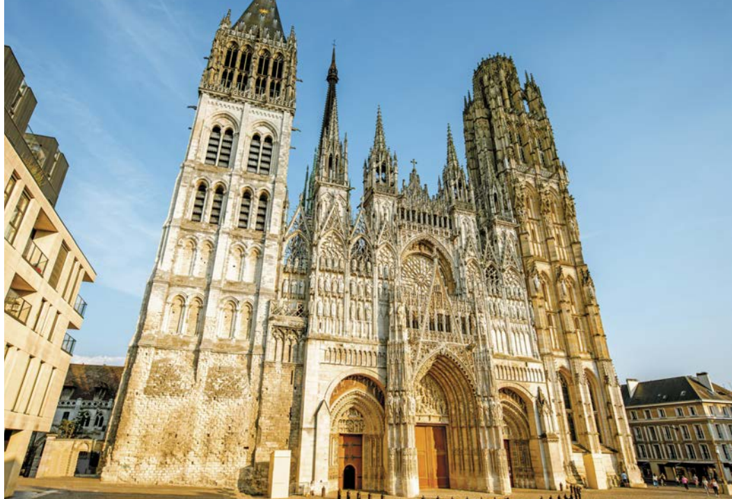
Notre-Dame de Rouen

rococo-style and Gothic decorations, still house a monastic community.