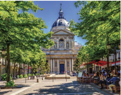
Latin Quarter, Paris