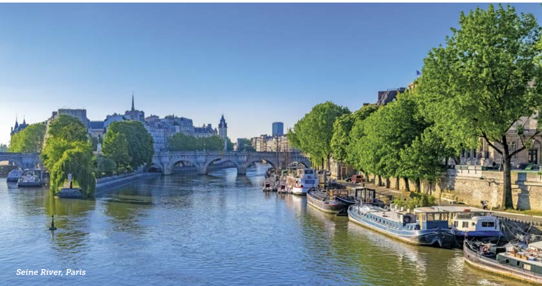
Seine River, Paris