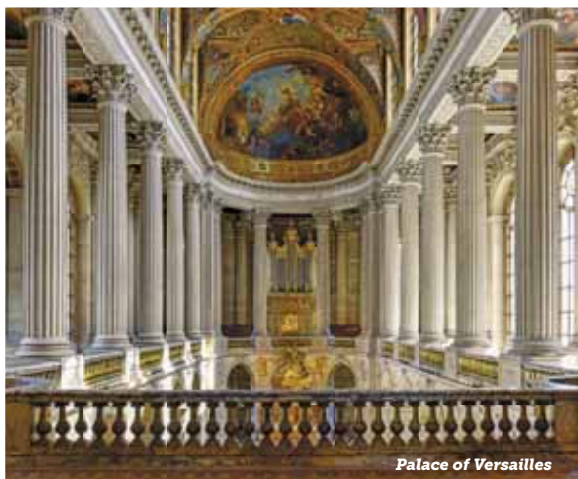
Palace of Versailles