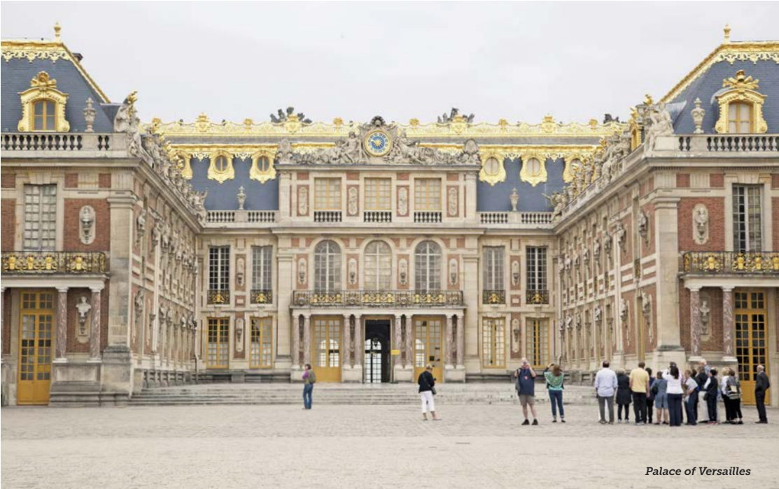
Palace of Versailles

Depart your gateway city for Paris, France.🌐