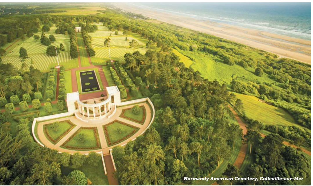
Normandy American Cemetery, Colleville-sur-Mer

Monet, Gustave Courbet and native son Eugène Boudin. Soak up the maritime ambience of its picture-perfect, 17th-century Vieux Bassin, or old harbor, located where the Seine River meets the English Channel. Stroll through the pretty harbor and along the narrow side streets to see the city's landmarks. The wooden Church of Sainte-Cathérine, crafted by 15th-century shipbuilders, is a special stand-out with ceilings over its two naves that resemble upturned hulls.