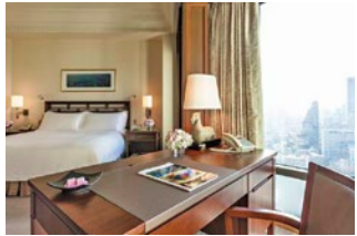
The Peninsula Bangkok | Bangkok, Thailand