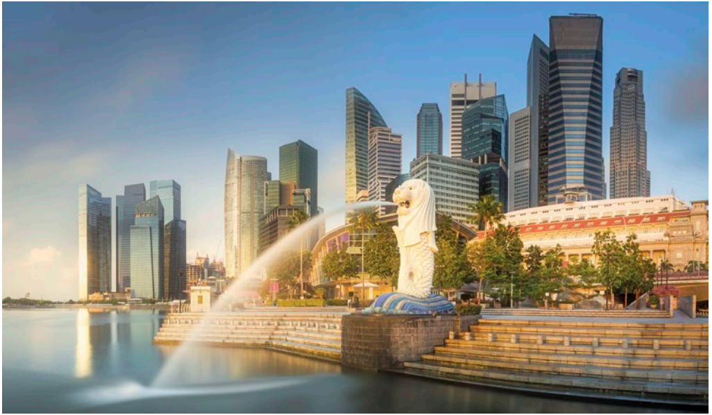
Merlion Park, Singapore