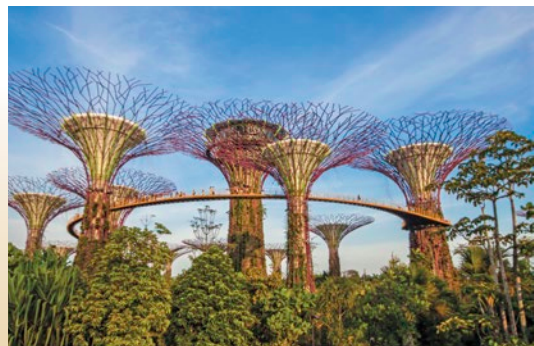
Gardens by the Bay, Singapore

Gardens by the Bay. Discover Singapore's landmark oasis of floral features and garden artistry. See the iconic Supertrees, made up of over 150,000 plants, plus bromeliads, orchids, ferns and climbers. Chart your own course through the Flower Dome, the world's largest