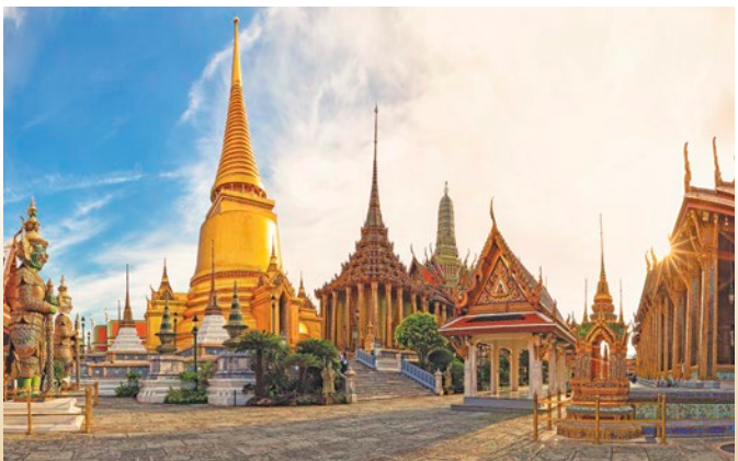
Grand Palace complex, Bangkok