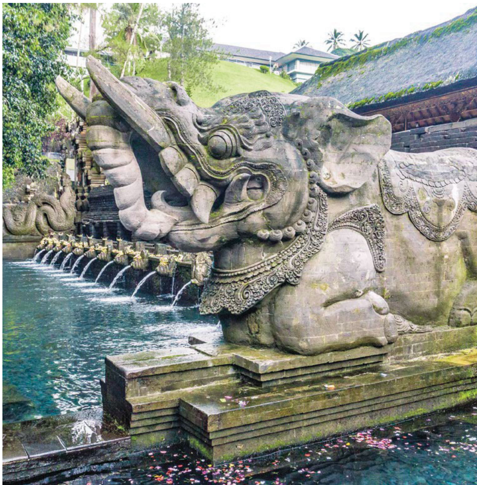
Tirta Empul, a holy water temple near Tampak Siring, Bali