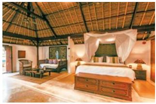
Belmond Jimbaran Puri Resort | Bali, Indonesia