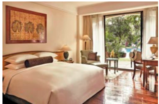
Sofitel Angkor Phokeethra Golf and Spa Resort | Siem Reap, Cambodia