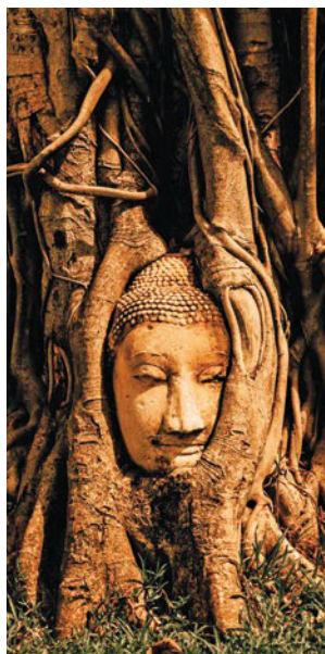
Buddha head, Ayutthaya

Knowledgeable Lecturers deepen your appreciation for the region and its history, culture and current events.