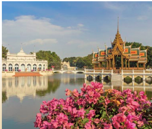
Bang Pa-In Palace

Elective | Sala Rim Naam. Join an evening immersed in Thai culture. This unique experience features a Thai dance show and a dinner of classic Thai dishes.