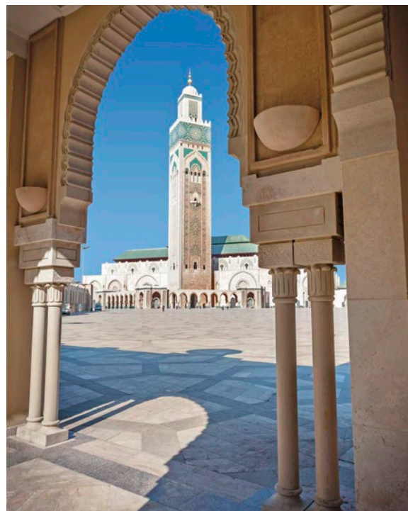
Hassan II Mosque, Casablanca

Embark on a journey that showcases Morocco's ancient cities, vibrant culture and riveting history. Begin in the capital city of Rabat, home to the famous Hassan Tower. Continue your Moroccan discovery in cosmopolitan Casablanca and Marrakech, a captivating imperial city with endless treasures. Explore shaded souks and a centuries-old square abundant with buskers and food stalls. Admire intricate palaces, the splendid Koutoubia Mosque and tranquil gardens, including the subtropical Jardin Majorelle. Delve deeper into the culture during a cooking lesson and culinary tour and a social visit with a Berber family.