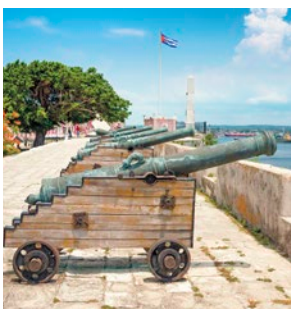
Cannons at fortification, Havana