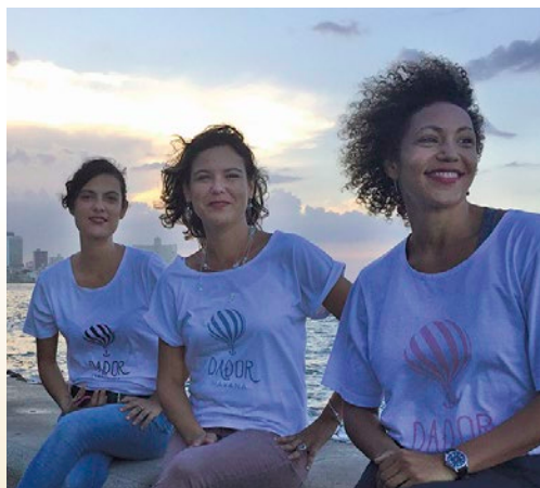
Founders and owners of Dador

Then, visit the historic Hotel Nacional for a tour of the property followed by dinner at a paladar .