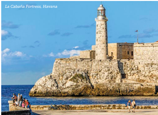
La Cabaña Fortress, Havana