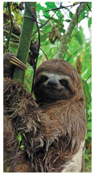
Sloth, Amazon Basin

Knowledgeable Lecturers deepen your appreciation for the region and its history, culture and current events.