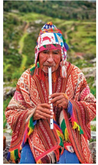
Traditional Peruvian music