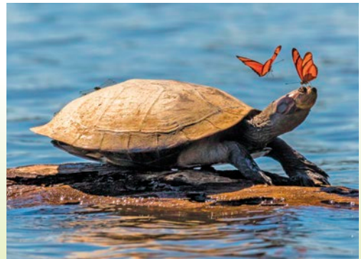
Amazon side-necked turtle