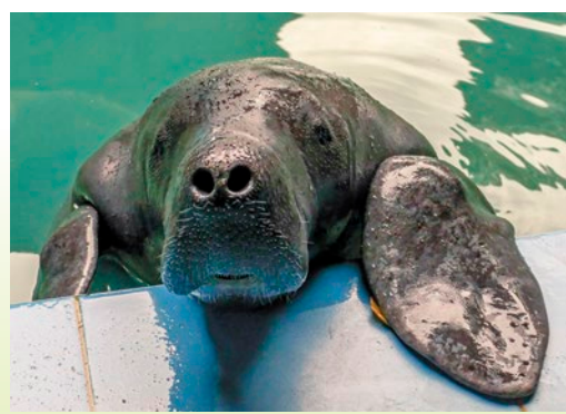
Manatee Rescue Center