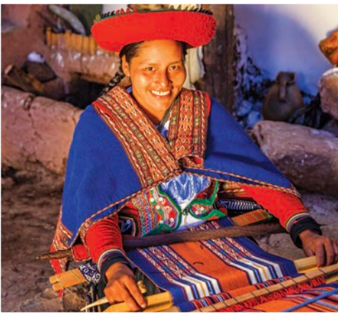
Above: Plaza de Armas, Cusco | Inset: Local woman weaving

Take in scenic views on a train ride through the Sacred Valley to the town of Aguas Calientes and the Inkaterra Machu Picchu Pueblo hotel.