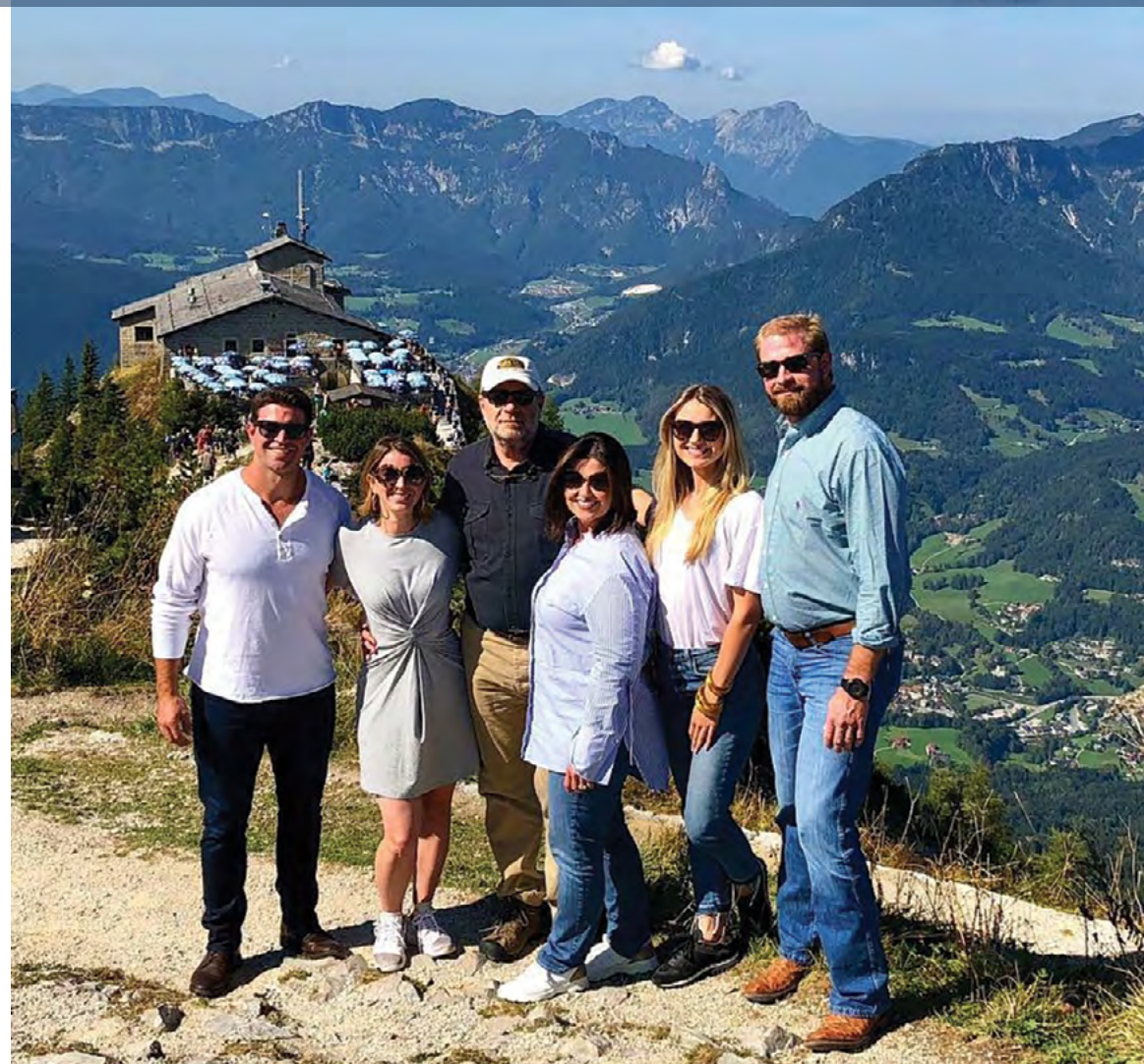
PHOTO: TOUR GUESTS AT HITLER’S EAGLE’S NEST, COURTESY OF THE NATIONAL WWII MUSEUM.