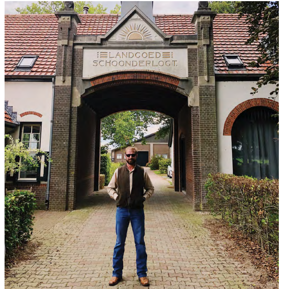
PHOTO: TOUR GUEST AT SCHOONDERLOGT, HOLLAND.