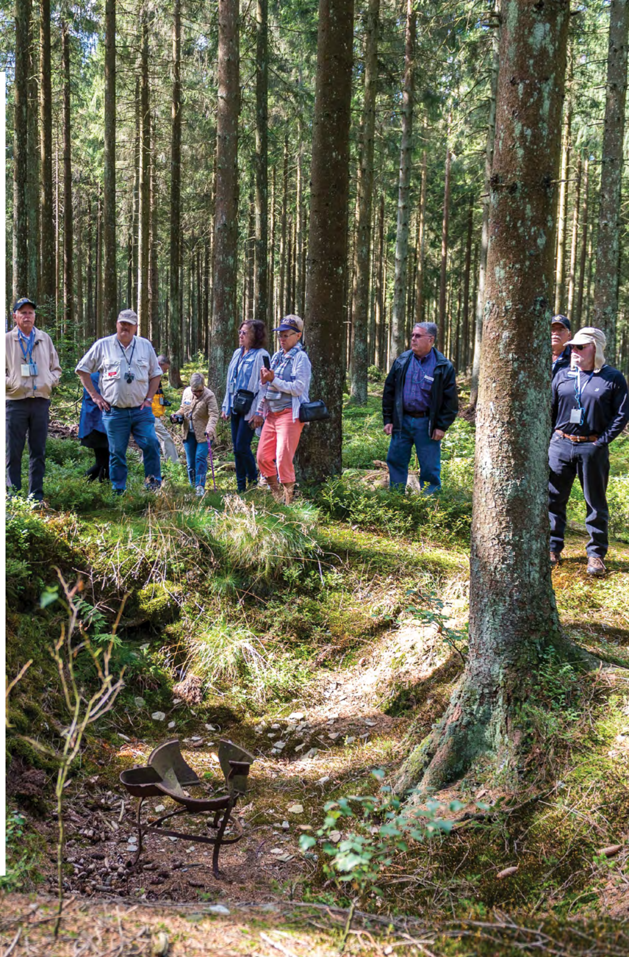
COVER PHOTO: AERIAL VIEW OF HITER’S EAGLES NEST. BACKGROUND PHOTO: TOUR GUESTS EXPLORE THE FOXHOLES DUG BY MEMBER OF EASY COMPANY DURING THE BATTLE OF THE BULGE. BOIS JACQUES FOREST, BELGIUM.