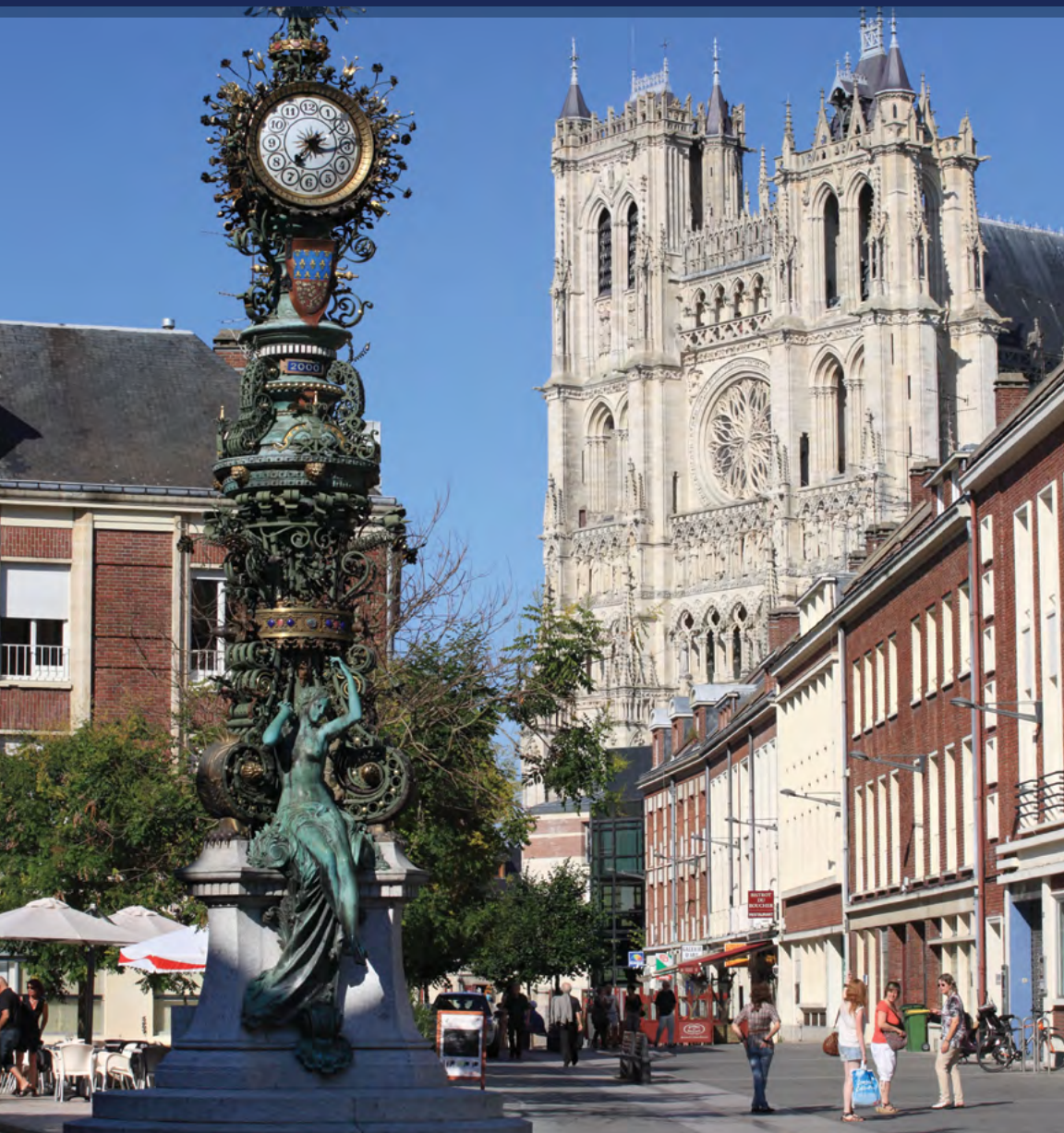
VIEW OF AMIENS DEWAILLY CLOCK AND THE CATHEDRAL OF OUR LADY OF AMIENS, AMIENS, FRANCE.