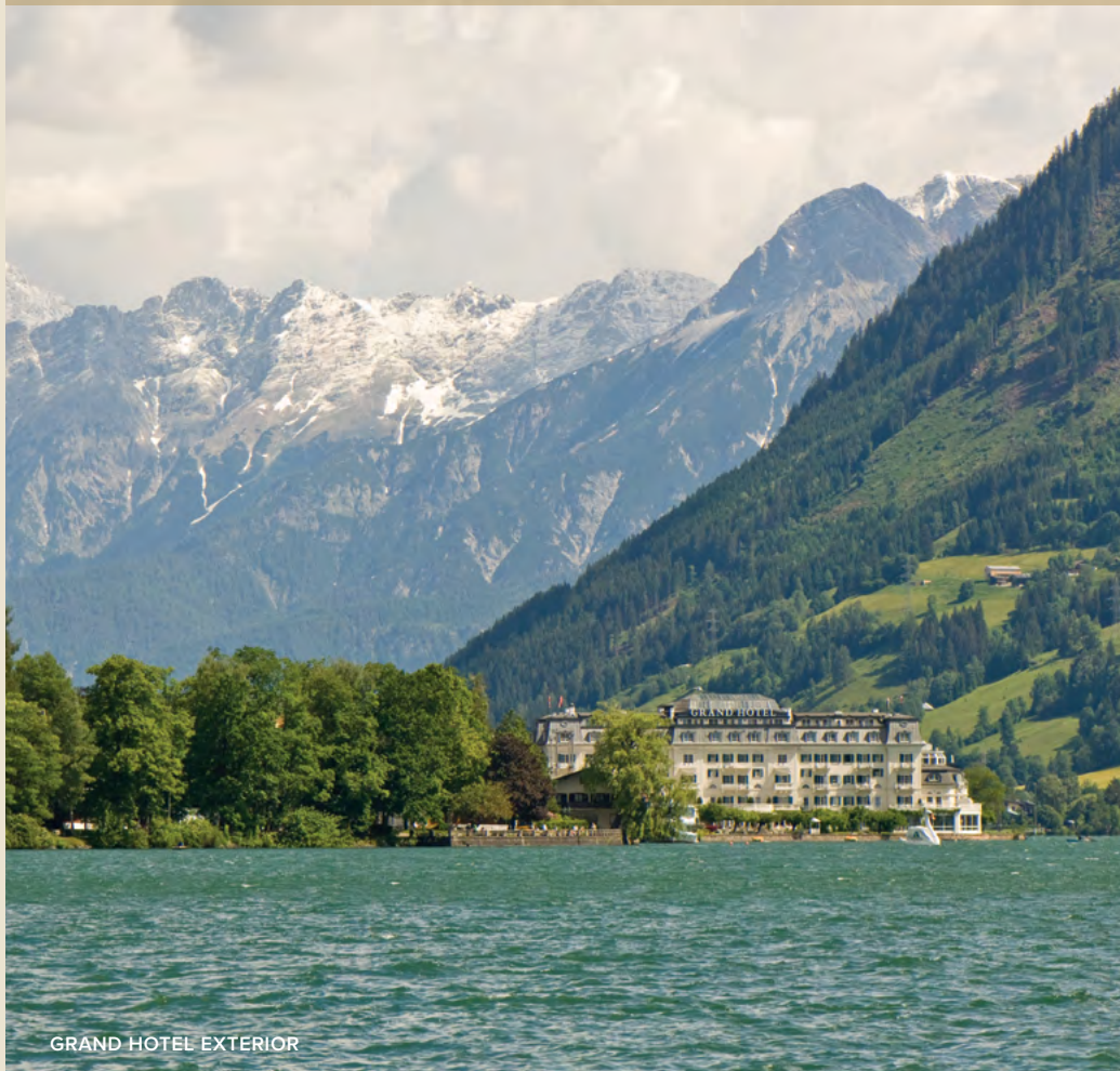
GRAND HOTEL EXTERIOR