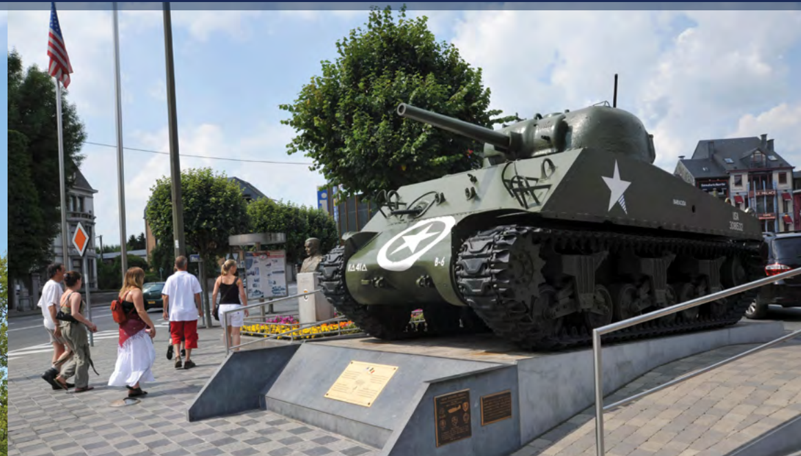
A SHERMAN TANK AND THE GENERAL MCAULIFFE MEMORIAL PICTURED ON THE MCAULIFFE SQUARE IN BASTOGNE, BELGIUM.