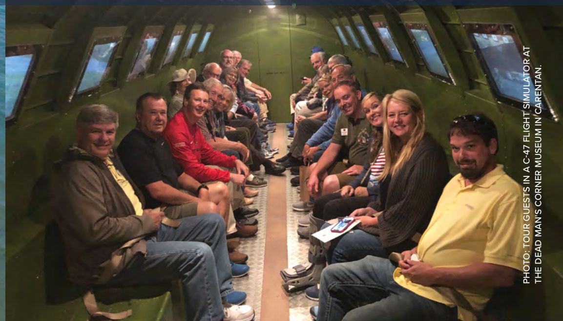
PHOTO: TOUR GUESTS IN A C-47 FLIGHT SIMULATOR AT THE DEAD MAN'S CORNER MUSEUM IN CARENTAN.