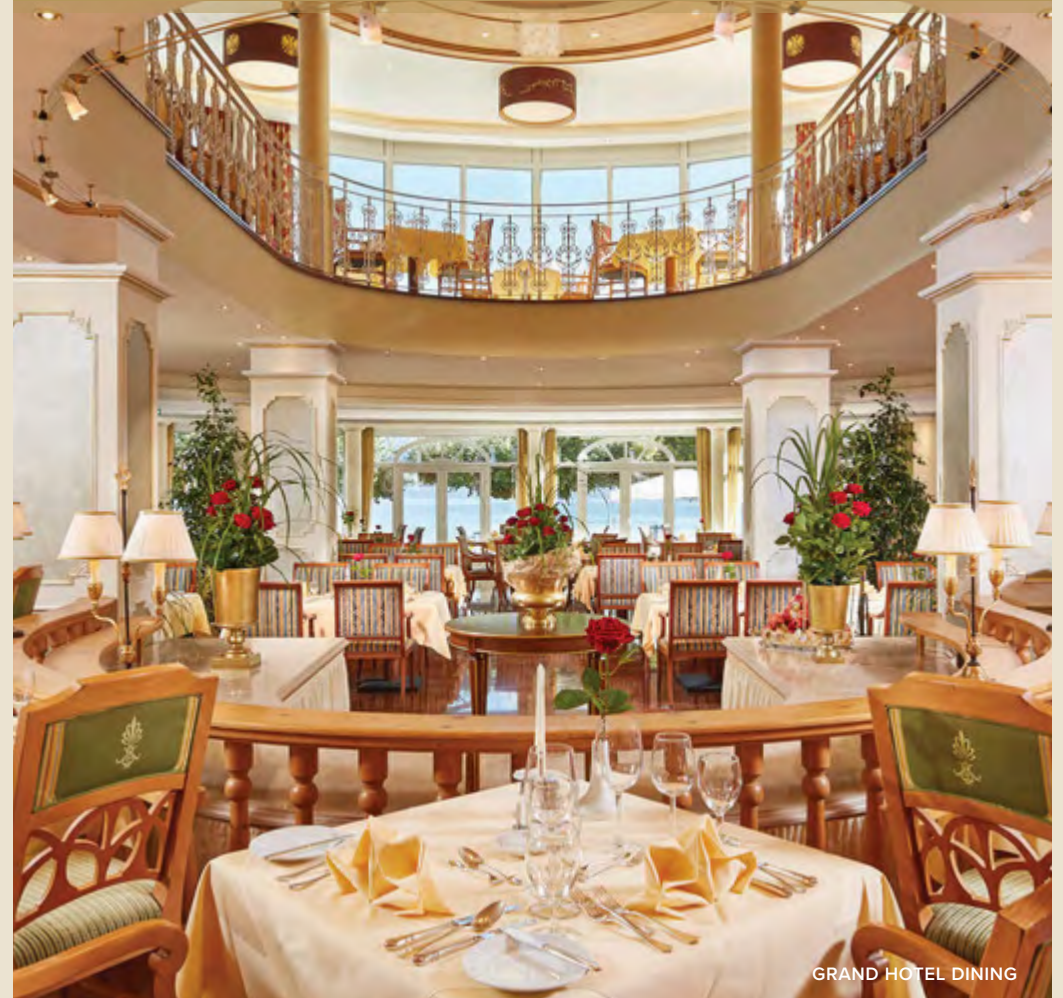
GRAND HOTEL DINING