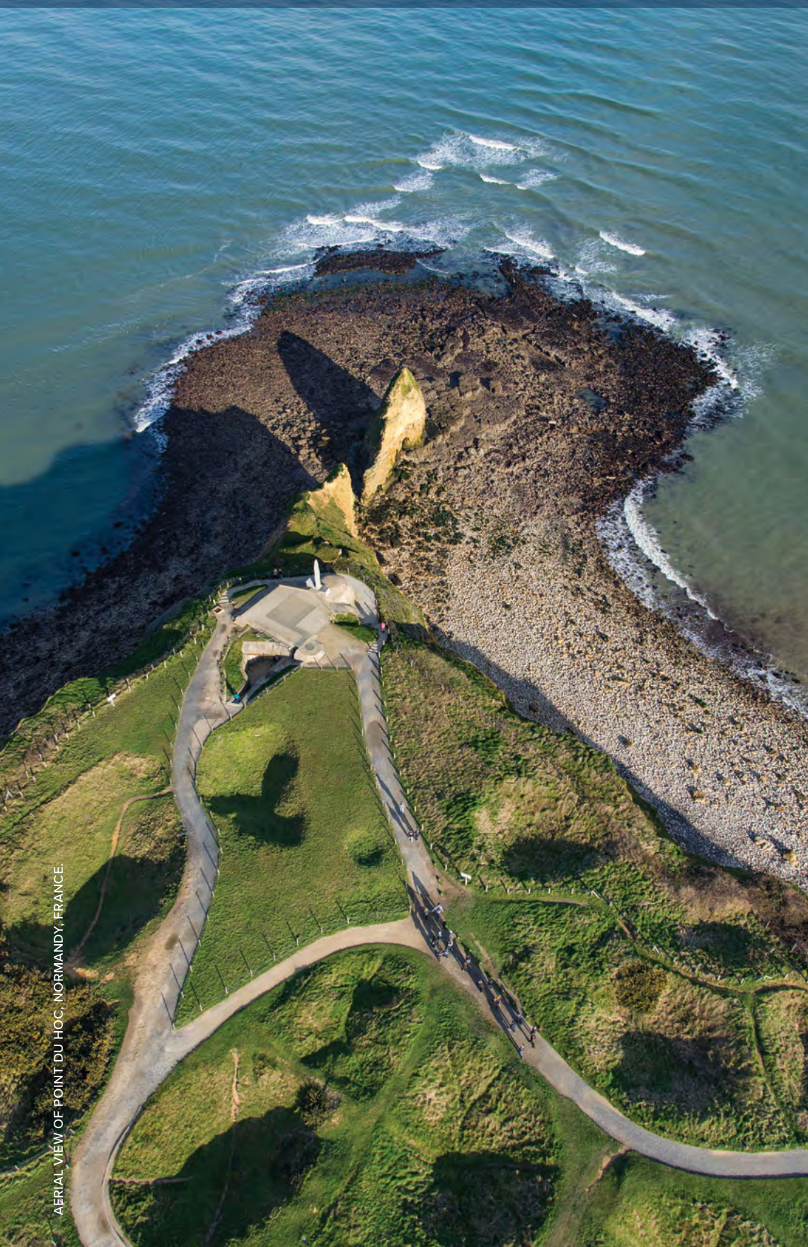
AERIAL VIEW OF POINT DU HOC, NORMANDY, FRANCE.