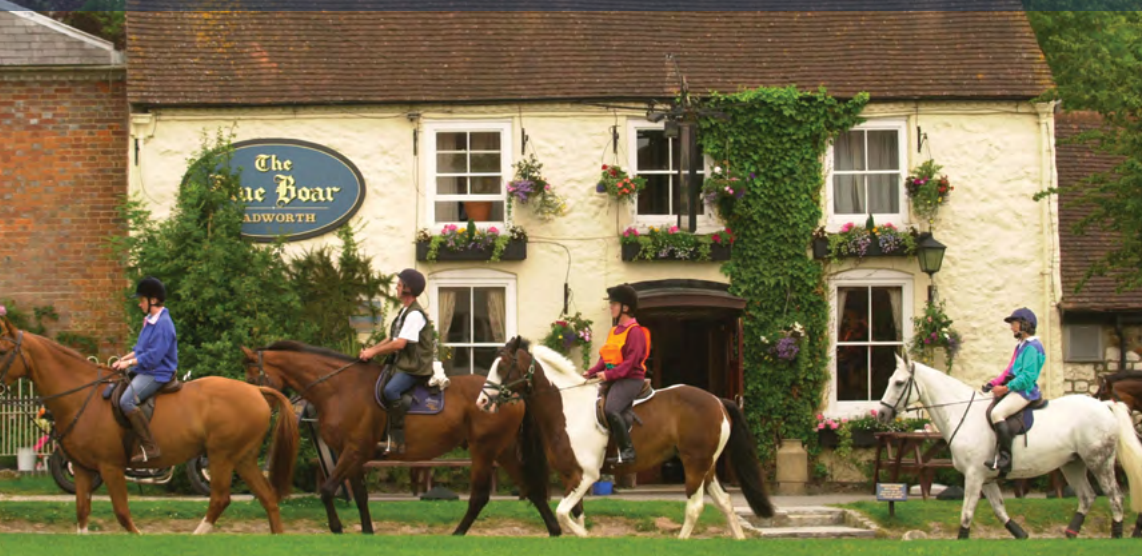
PHOTO: THE BLUE BOAR PUB IN THE VILLAGE OF ALDBOURNE , ENGLAND