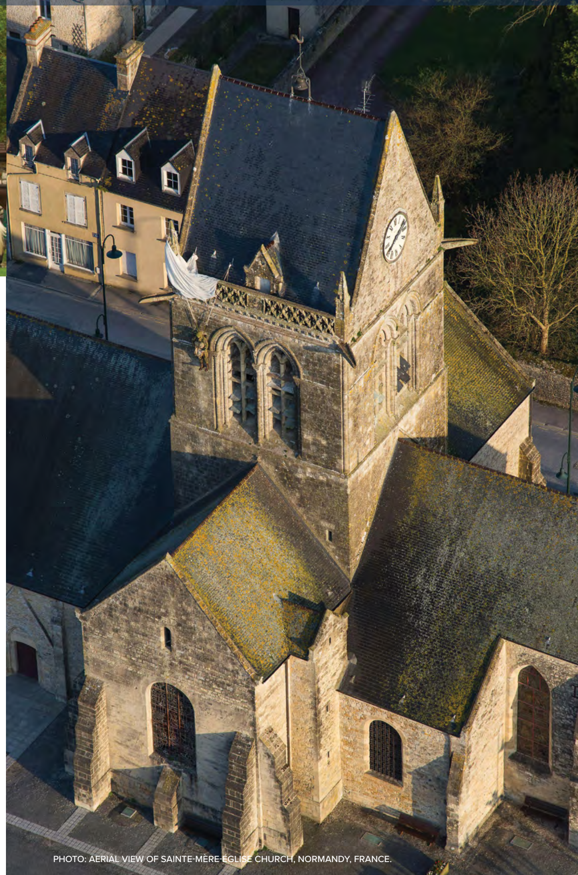
PHOTO: AERIAL VIEW OF SAINTE-MÈRE-ÉGLISE CHURCH, NORMANDY, FRANCE.

Accommodations: La Ferme de la Rançonnière (B, D)