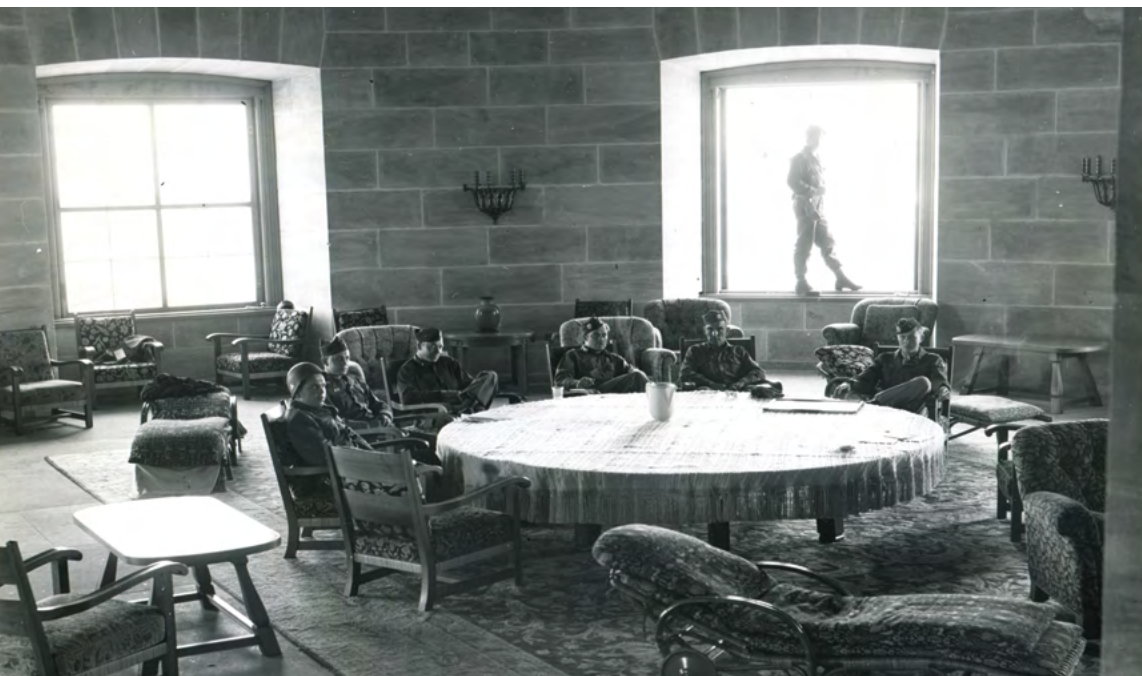
PHOTO: 101ST AIRBORNE AT HITLER’S EAGLE’S NEST.

Accommodations: Grand Hotel Zell Am See (B, D)