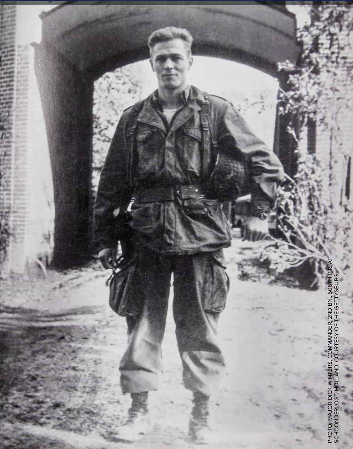
PHOTO: MAJOR DICK WINTERS, COMMANDER, 2ND BN., 506TH PIR, AT SCHOONDERLOGT, HOLLAND.

Distinguished Service Cross, Bronze Star with Oak Leaf Cluster and Purple Heart