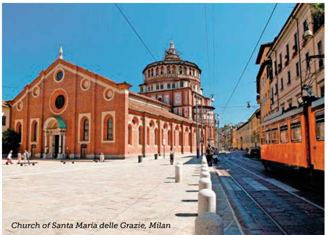
Church of Santa Maria delle Grazie, Milan