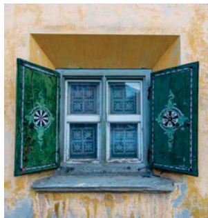
Charming Engadine architecture