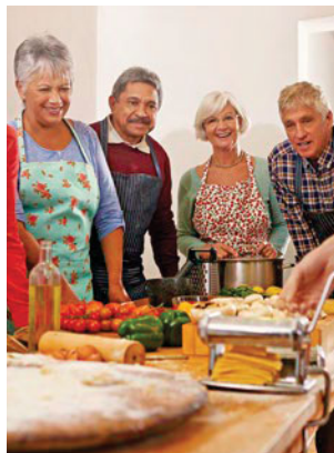
Piedmontese cooking class