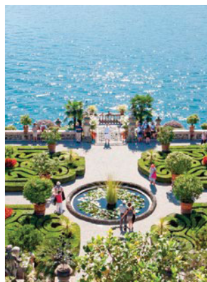
Isola Bella, Lake Maggiore