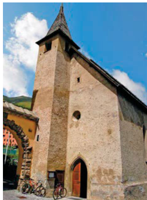
Old church, Zuoz