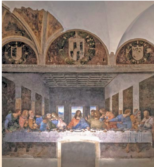
Leonardo da Vinci's "The Last Supper"